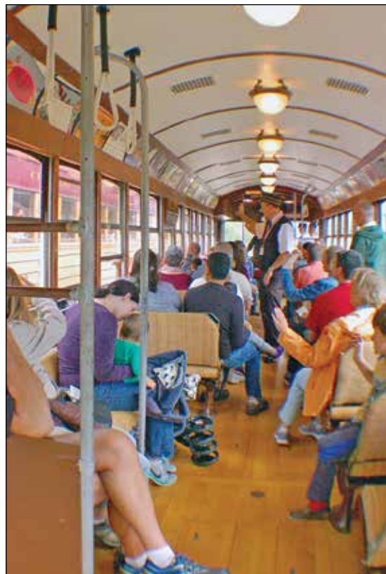
Passengers are shown riding on Car #846, the historic Milwaukee Streetcar that's among the numerous trains run by the railroad.

Other ways to support the railroad include donations, matching gifts, sponsorship, endowment and legacy giving. For details send an email to fundcomm@easttroyrr.org or call 262-642-3263.