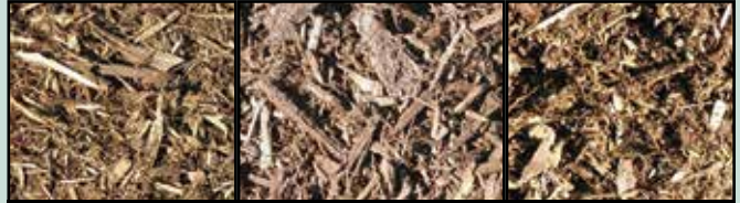
Hardwood Mulch Brown Enviro Mulch Pine Mulch

We have indoor stored, dry pulverized and screened topsoil and compost.