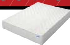
v1 FIRM 1-Sided No Flip QUEEN SET PRICING

This CUTS OUT THE MIDDLEMAN to keep prices affordable for you.