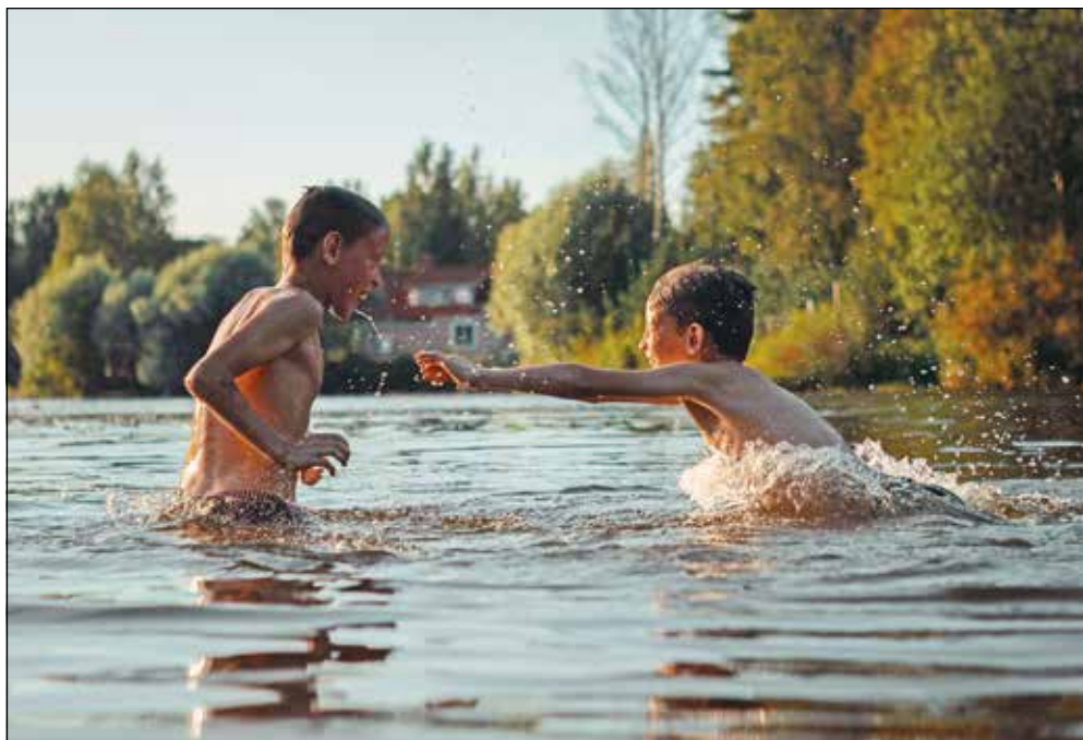
Now that it's the time of year when more people will be spending time on the water, safety classes are a good idea for all kids – and their parents.