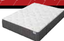
v3 PLUSH 1-Sided No Flip QUEEN SET PRICING

$499 TWIN SET $599 FULL SET $899 KING SET