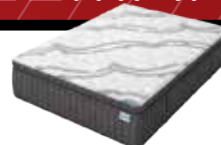
v7 PLUSH 1-Sided No Flip QUEEN SET PRICING

$1049 TWIN SET $1349 FULL SET $1999 KING SET