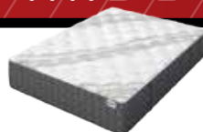
v5 FIRM 1-Sided No Flip QUEEN SET PRICING

$749 TWIN SET $899 FULL SET $1399 KING SET