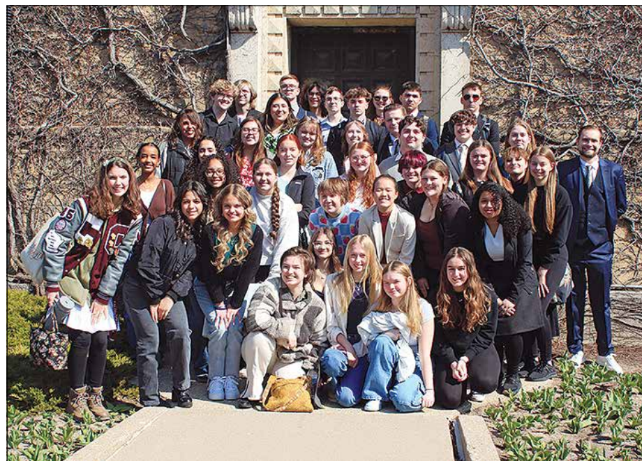
The Westosha Central High School forensics team recently earned an Excellence in Speech Award from the Wisconsin Interscholastic Speech & Dramatic Arts Association.