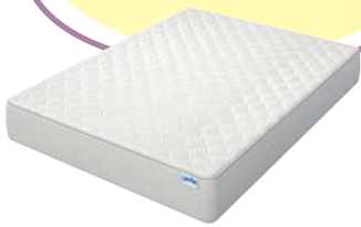
v1 FIRM 1-Sided No Flip

EXTRA FACTORY DIRECT SAVINGS WITH THESE COUPONS!