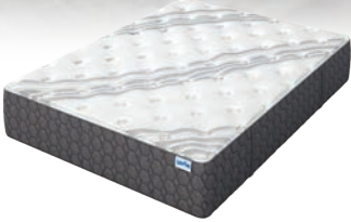
v5 FIRM 1-Sided No Flip