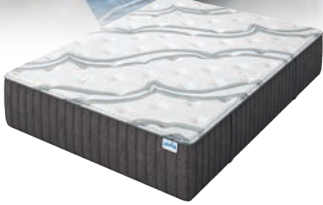
v7 PLUSH 1-Sided No Flip