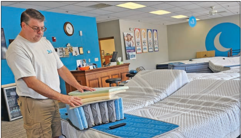
An adjustable frame can add comfort and may also help prevent snoring.

CALL NOW: (262) 539-4460 Ask for Don Go to www.vetstruck.com for applications.