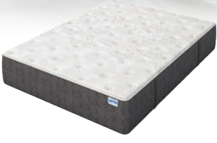
v3 PLUSH 1-Sided No Flip