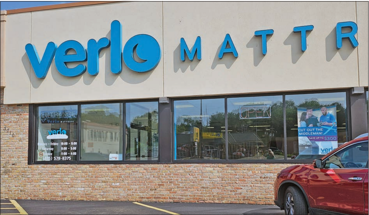
SANDRA LANDEN MACHAJ Southern Lakes Newspapers

The Verlo shop where mattresses are built is at 3710 W. Elm, McHenry, which also has a showroom. Other showrooms are at 2462 Highway 120, Lake Geneva and at 5150 Northwest Highway, Unit 1, Crystal Lake.