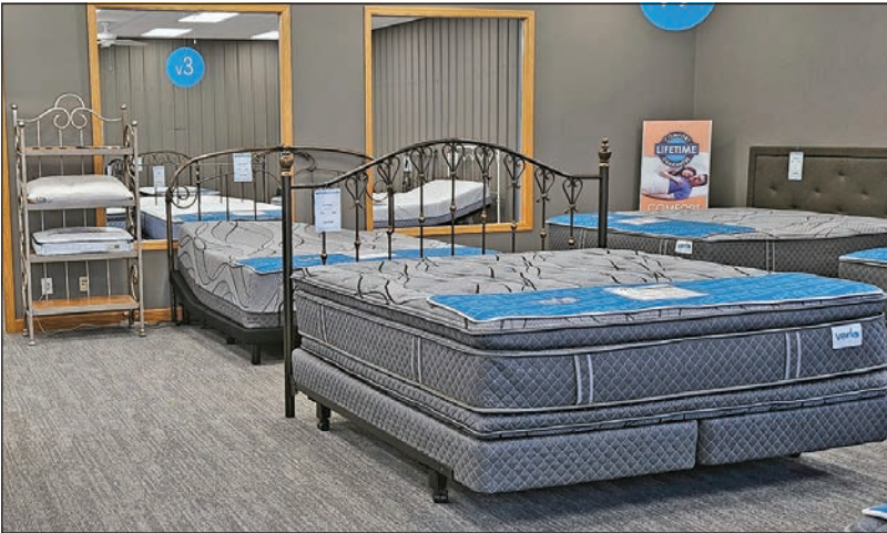
The large showroom in Lake Geneva offers an opportunity to try a variety of mattresses made by Verlo.

When entering a Verlo store today, a clean, open environment greets customers. Mattress styles are arranged in pods to allow customers to peruse various styles, firmness and price points. Sales staff will