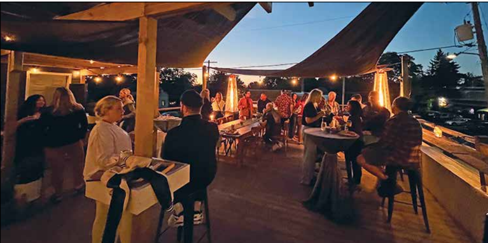
The Social Affair, 2919 Main St., located in the heart of East Troy, is hosting live music Up on the Rooftop from May to October. Check out the venue's upcoming events, including pop up multi-course prix fixe dinners on Facebook.