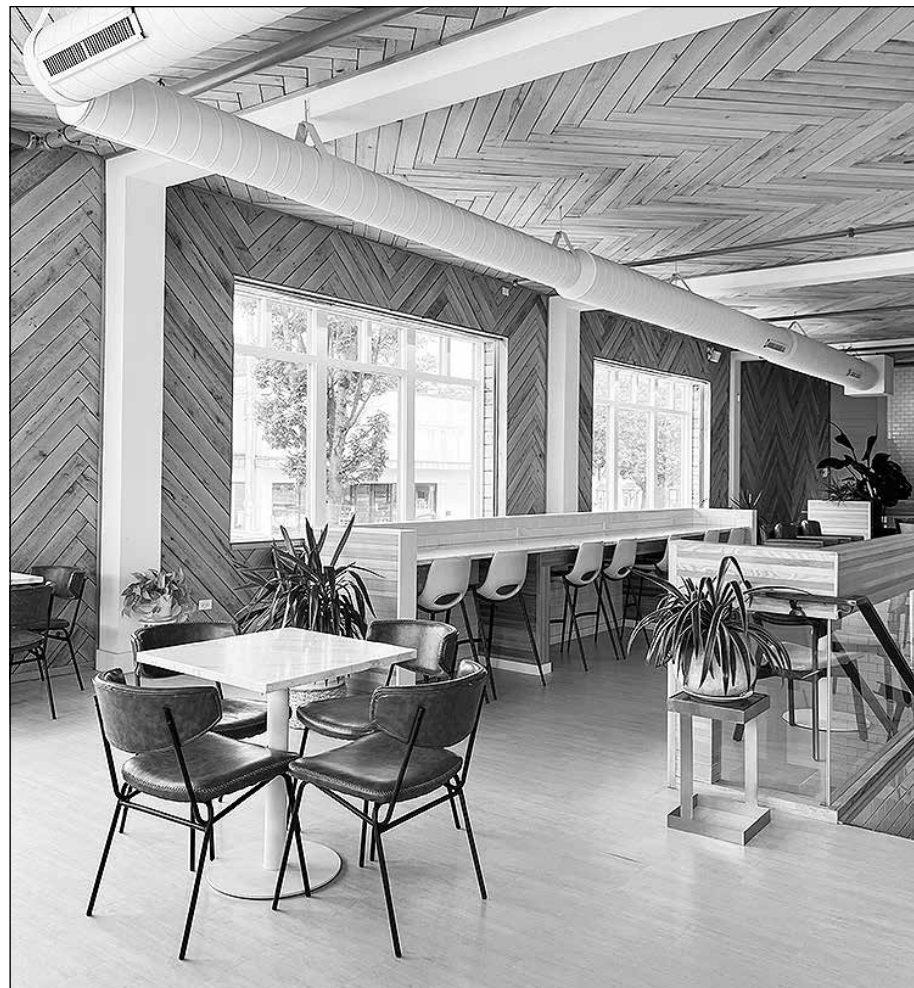
The inside of the downtown Boxed and Burlap space offers plenty of seating for both individuals and small groups.

SUBMITTED PHOTO Delavan Fascinating Folks