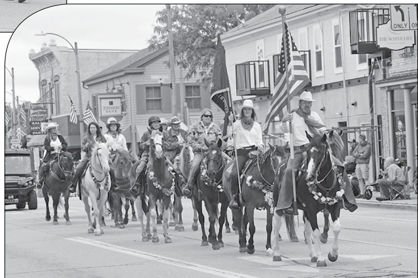
Burlington Jamboree 2025

Following the ceremony at Echo Park, veterans continue to the City of Burlington Cemetery, St. Mary's Cemetery, and St. Charles' Cemetery, to again honor veterans who died in service of their country.