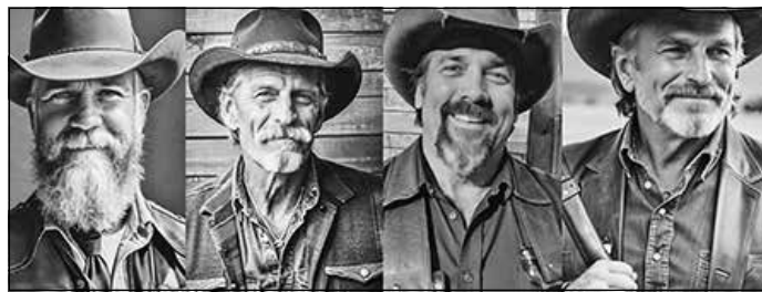
Twin Rivers Band