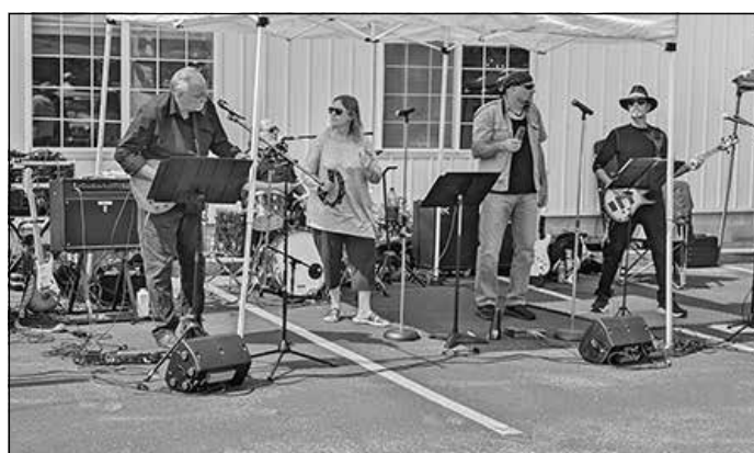
Shades of Gray