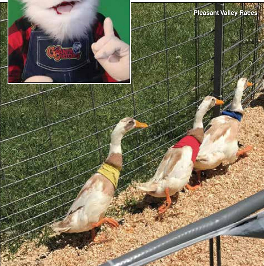
Pleasant Valley Races