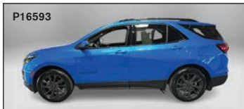
P16593 2024 CHEVY EQUINOX RS