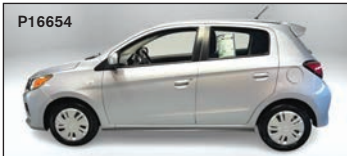
P16654 2022 MITSUBISHI MIRAGE