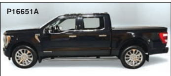
P16651A 2021 FORD F-150 LIMITED