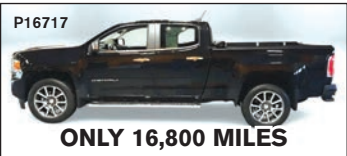
P16717 2022 GMC CANYON DENALI ONLY 16,800 MILES