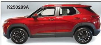
K250289A 2023 CHEVY TRAILBLAZER LT