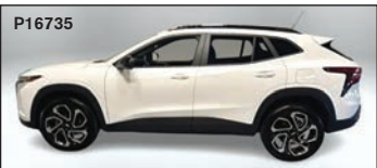
P16735 2024 CHEVY TRAX 2RS