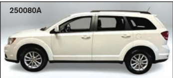
250080A 2017 DODGE JOURNEY SXT