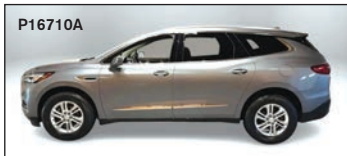
P16710A 2020 BUICK ENCLAVE ESSENCE