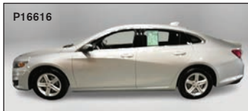
P16616 2022 CHEVY MALIBU LT