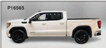
P16565 2021 GMC SIERRA ELEVATION