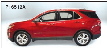
P16512A 2020 CHEVY EQUINOX PREMIER