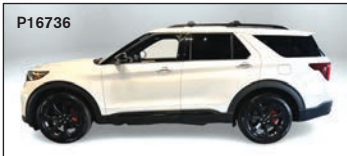
P16736 2022 FORD EXPLORER ST