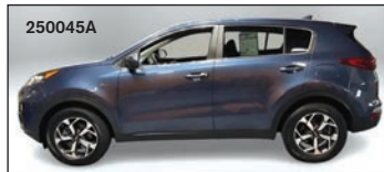
250045A 2022 KIA SPORTAGE LX