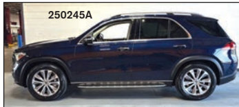
250245A 2022 MERCEDES-BENZ GLE350