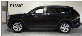
P16597 2021 VW ATLAS SE