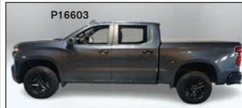
P16603 2021 CHEVY SILVERADO LT