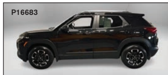
P16683 2021 CHEVY TRAILBLAZER LT