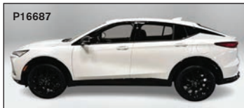
P16687 2024 BUICK ENVISTA SPORT TOURING