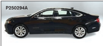
P250294A 2017 CHEVY IMPALA LT