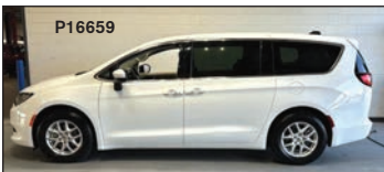
P16659 2022 CHRYSLER VOYAGER LX