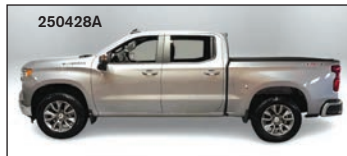
250428A 2024 CHEVY SILVERADO 1500 LT