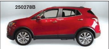
250278B 2019 BUICK ENCORE PREFERRED