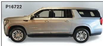
P16722 2023 GMC YUKON XL DIESEL