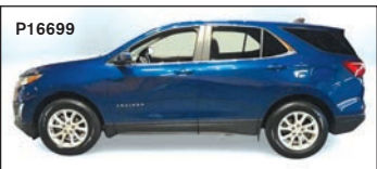
P16699 2021 CHEVY EQUINOX LT