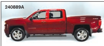
240889A 2017 CHEVY SILVERADO LT