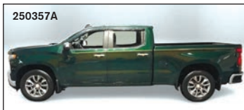
250357A 2020 CHEVY SILVERADO LT