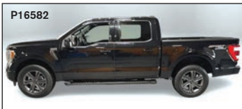
P16582 2023 FORD F-150 LARIAT