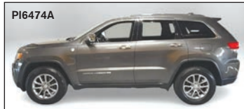
P16474A 2014 JEEP GRAND CHEROKEE LTD.