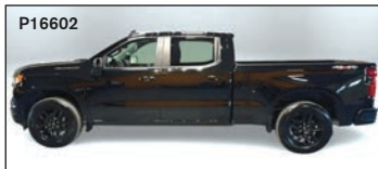
P16602 2023 CHEVY SILVERADO RST