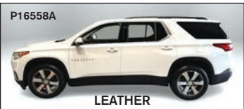
P16558A 2019 CHEVY TRAVERSE LT LEATHER