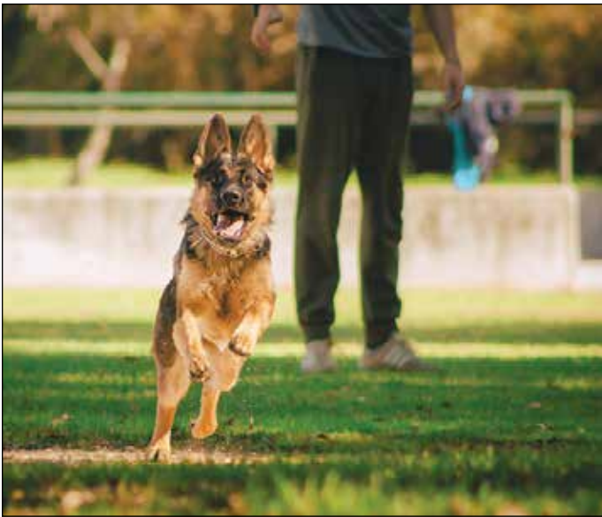
From the left: According to experts, certain breeds of dogs are more trainable than others including German shepherd and golden retriever.