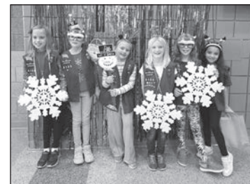
Troop 8015 Let It Snow