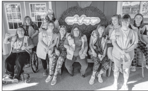
Troop 7166 at an apple orchard