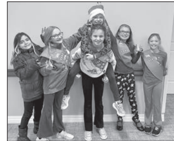
Troop 7563 Community Service

Please patronize these businesses that support our local Girl Scouts