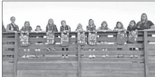
Troop 8015 Bridging