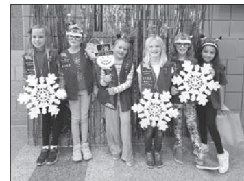
Troop 8015 Let It Snow