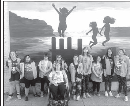
Troop 7166 Outdoor Art Badge