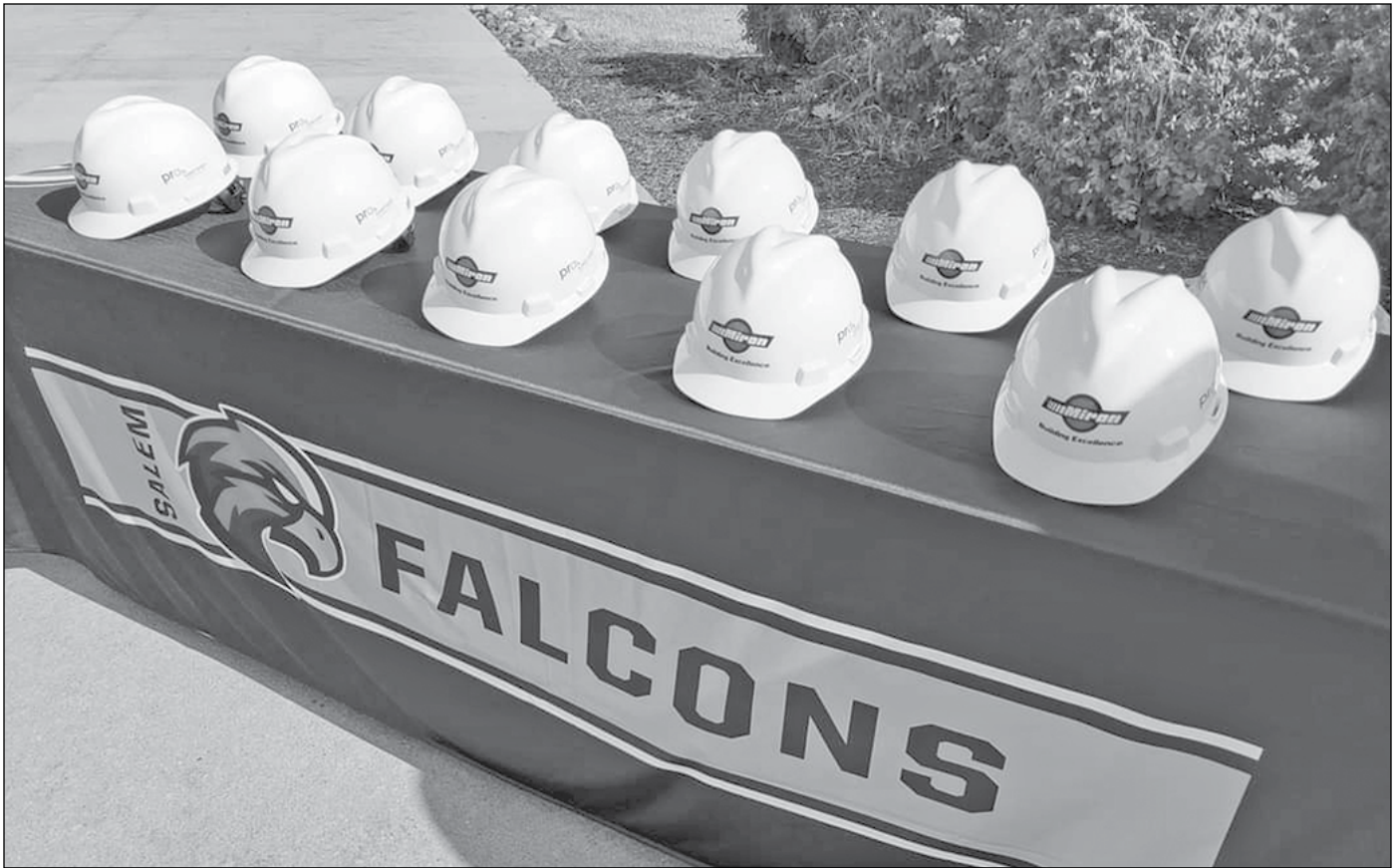
Miron Construction hard hats sit on a table at Salem Grade School before the school's ceremonial groundbreaking last June. The school expanded its facility following support through a capital improvement referendum.