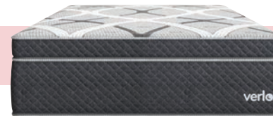
v7 PLUSH 1-Sided No Flip