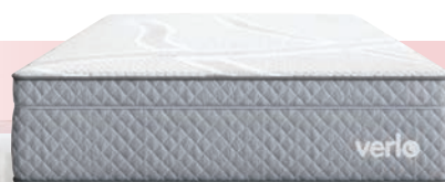
v5 FIRM 1-Sided No Flip