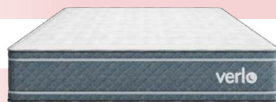
v1 FIRM 1-Sided No Flip