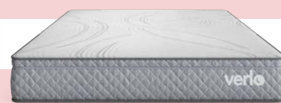
v3 PLUSH 1-Sided No Flip