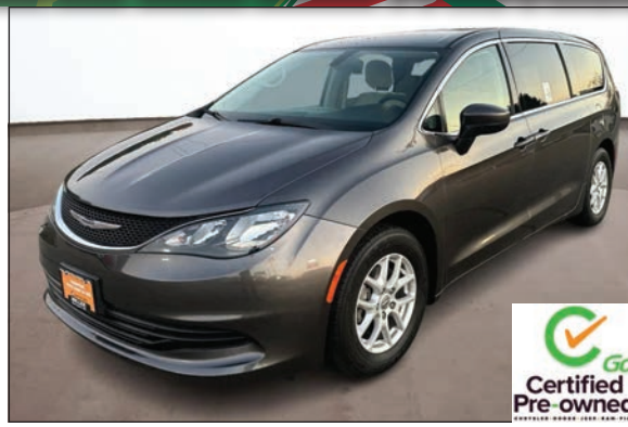
2017 CHRYSLER PACIFICA TOURING Bluetooth, 3rd rear seat, power tailgate, rear view camera, Apple Car Play. #34195A WAS $20,995..... MARKET BASED PRICE $16,395*