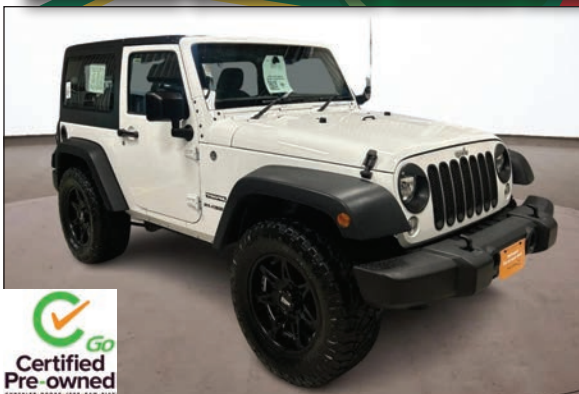
2015 JEEP WRANGLER SPORT 4WD/AWD, satellite radio, entertainment system, big wheels and tires. #P3412 WAS $19,995..... MARKET BASED PRICE $14,995*

WE ARE OFFERING THESE VEHICLES AT HUGE SAVINGS BEFORE WE TAKE THEM TO AUCTION