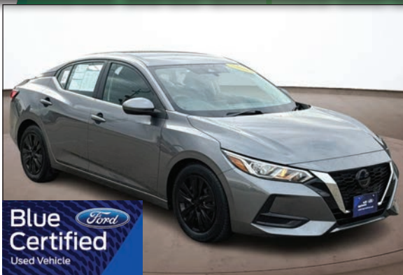
2021 NISSAN SENTRA FWD, Bluetooth, Apple Car Play, rear view camera, lane departure & blind spot monitor. #P3145 WAS $20,995..... MARKET BASED PRICE $16,995*