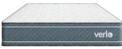
v1 FIRM 1-Sided No Flip