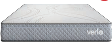
v3 PLUSH 1-Sided No Flip