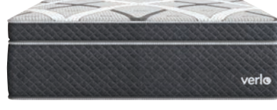
v7 PLUSH 1-Sided No Flip