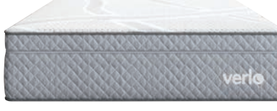
v5 FIRM 1-Sided No Flip