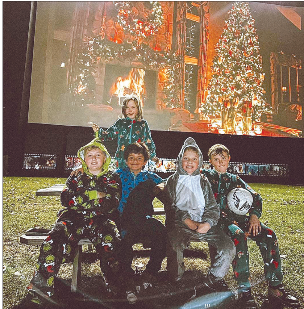
Kids gather in front of the big screen at the McHenry Outdoor Theater during the 2023 holiday season. Santa plans to greet visitors there this weekend. On the big screen will be Will Ferrell in “Elf”, followed by “The Nativity Story”. For more information visit goldengacinecinemas.com.

For other information, visit goldengacinecinemas.com, or find the McHenry Outdoor Theater on Facebook.