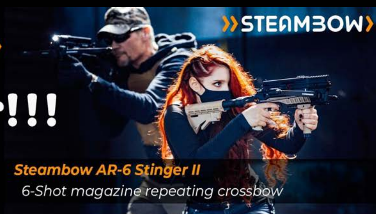
Steambow AR-6 Stinger II 6-Shot magazine repeating crossbow