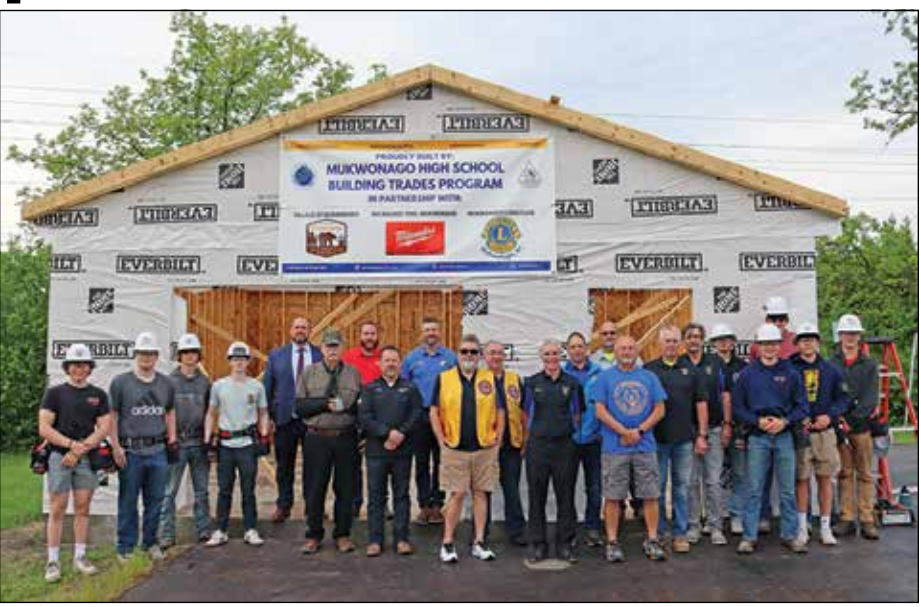
The entire crew that had a hand in the construction of a storage garage for use by local soccer teams at Miniwaukan Park gathers in front of the building. The project was a partnership between Mukwonago High School's Building Trades Program and the Village of Mukwonago, the Mukwonago Lions Club, and Milwaukee Tools of Mukwonago.