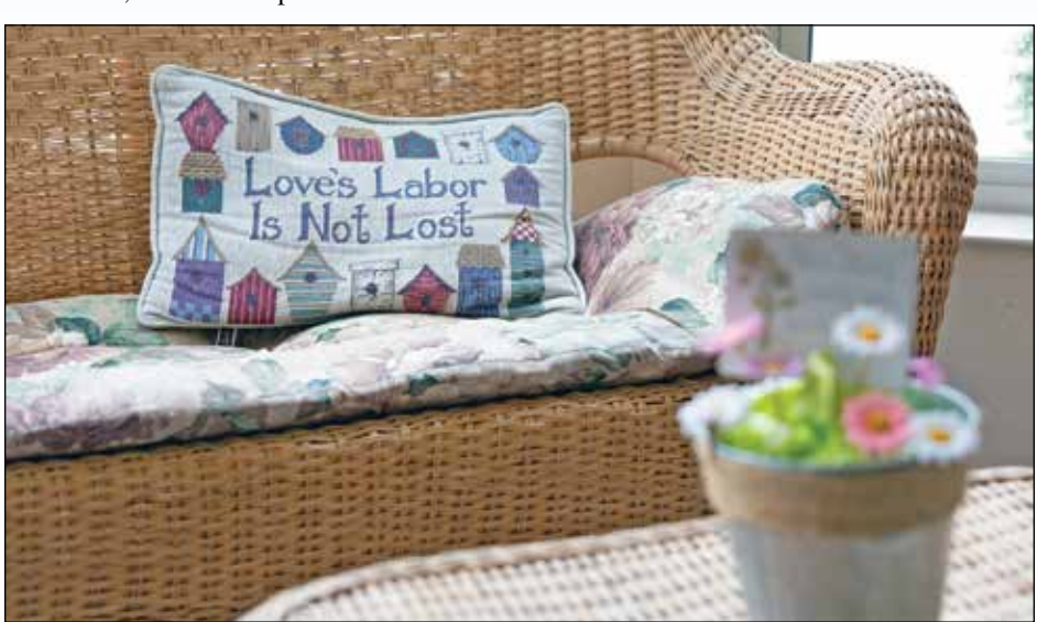
Pillows and flowers decorate the sunroom at Marvin's Manor, an assisted living facility in Horicon. The government was paying just over half the private-pay rate, which was far below the cost of paying the facility's workers, according to the owner.

All works created, published, posted or disseminated by Wisconsin Watch do not necessarily reflect the views or opinions of Southern Lakes Newspapers or any of its affiliates.