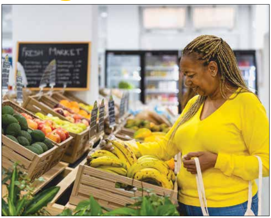
Proper nutrition is critical to older adults' overall vitality, providing energy, helping to control weight, and even preventing and managing some diseases. Unfortunately, studies show 10% of older people don't eat enough, while one-third eat too much.

Get your nutrients – according to the National Council on Aging, older adults should eat a variety of foods to get all the nutrients they need, including lean protein for muscle mass, as well as fruits and vegetables, whole grains and low-fat dairy. Choose foods with little to no added sugar, saturated fats and sodium. For an example of what a healthy plate looks like, visit