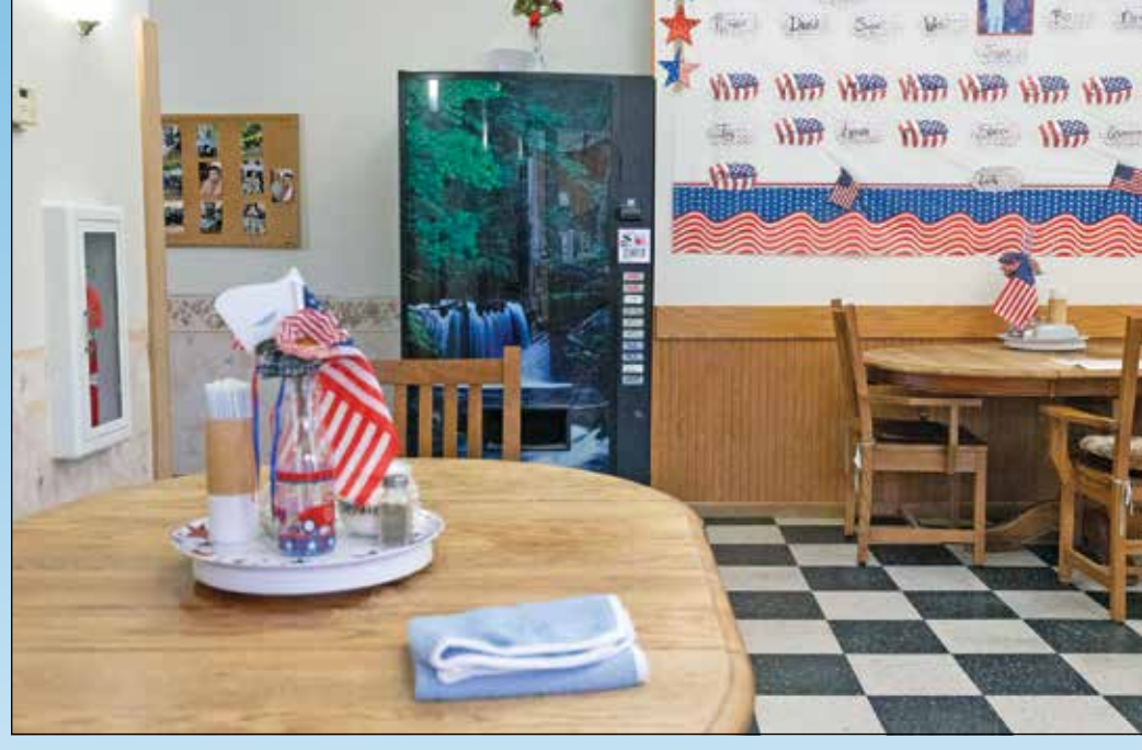
The dining room inside Marvin's Manor, an assisted living facility in Horicon, is shown sitting empty in August. The closure forced 12 residents to find new homes.