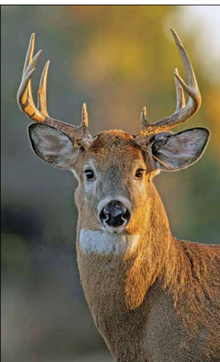
Wisconsin Department of Natural Resources staff remind hunters that making carcass disposal and following baiting and feed regulations are three important ways to help slow the spread of CWD. To learn more, visit dnr.wisconsin.gov and search “CWD.”