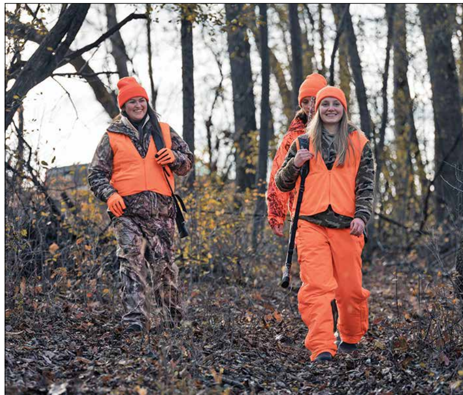
Remember, at least 50% of each hunter’s clothing above the waist must be blaze orange or pink any time there is a firearm deer season in progress, and any head covering must be at least 50% blaze orange or pink.

To learn more about CWD, visit the DNR’s website, dnr.wisconsin.gov and search “CWD.”