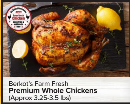
Berkot's Farm Fresh Premium Whole Chickens (Approx 3.25-3.5 lbs)