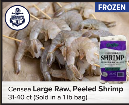
Censea Large Raw, Peeled Shrimp 31-40 ct (Sold in a 1 lb bag)