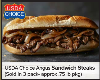
USDA Choice Angus Sandwich Steaks (Sold in 3 pack- approx .75 lb pkg)