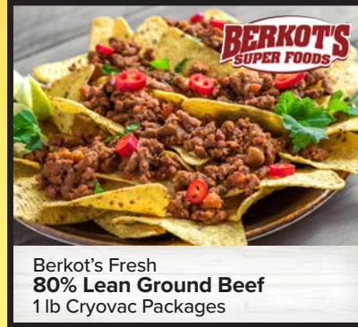
Berkot's Fresh 80% Lean Ground Beef 1 lb Cryovac Packages

*Discounts applied at register when buying any 5 meat items included in 5 for $25 Sale.