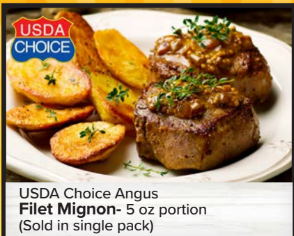
USDA Choice Angus Filet Mignon- 5 oz portion (Sold in single pack)