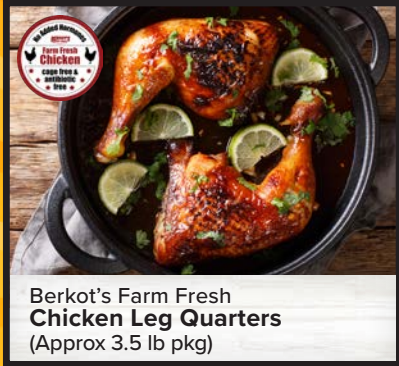
Berkot's Farm Fresh Chicken Leg Quarters (Approx 3.5 lb pkg)