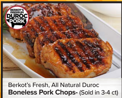
Berkot's Fresh, All Natural Duroc Boneless Pork Chops- (Sold in 3-4 ct)

ALL ITEMS AVAILABILITY BASED ON SUPPLY. QUANTITIES MAY BE LIMITED. NO RAINCHECKS WILL BE PROVIDED.