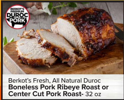
Berkot's Fresh, All Natural Duroc Boneless Pork Ribeye Roast or Center Cut Pork Roast- 32 oz