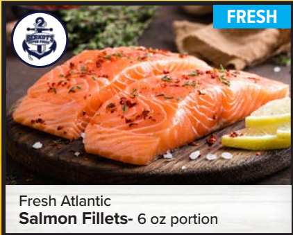
Fresh Atlantic Salmon Fillets- 6 oz portion