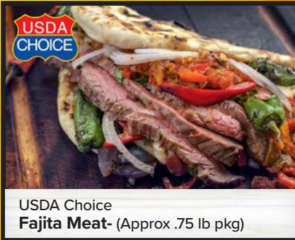
USDA Choice Fajita Meat- (Approx .75 lb pkg)