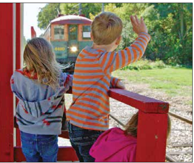
Children excitedly await the arrival of a train at the Elegant Farmer station, led by Chicago Elevated Car 4420.