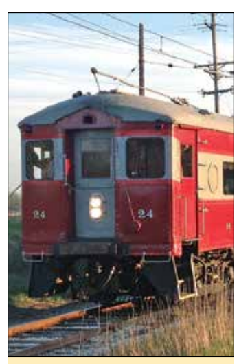
Among the special events hosted by the railroad each year are several dinner trains.