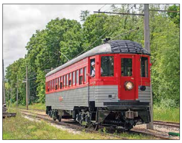
Car 761 makes its way along the East Troy Electric Railroad route, which travels between East Troy and Mukwonago.