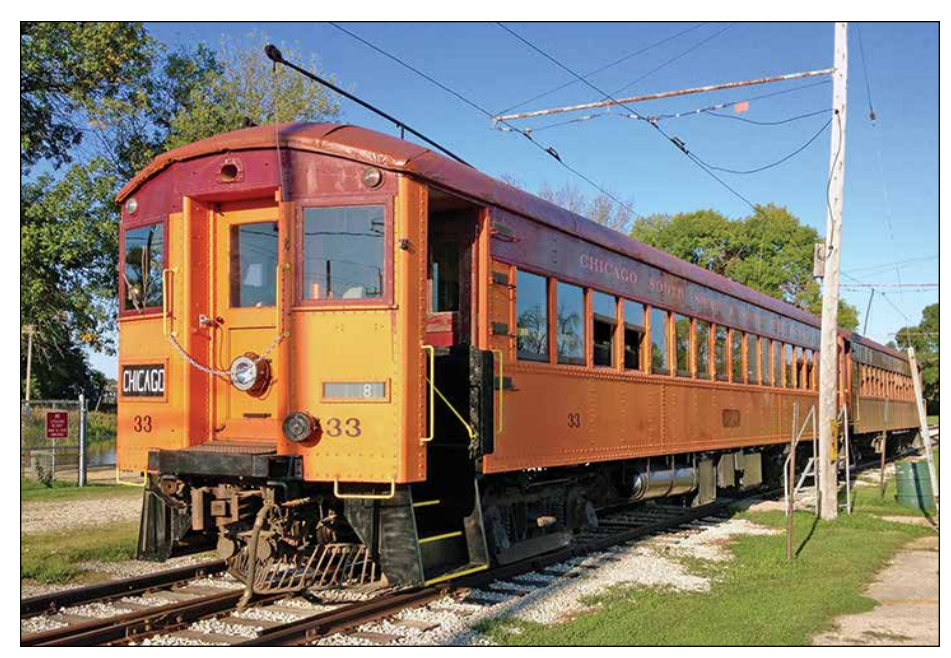
This is one of a trio of Chicago trains the railroad operates. They're generally used for charters. Our Town