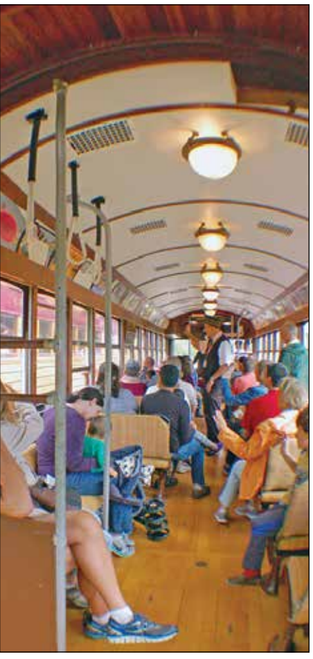
Passengers are shown riding on Car #846, the historic Milwaukee Streetcar that's among the numerous trains in the railroad's fleet.

For more information, call 262-642-3263 or visit www.easttroyrr.org.