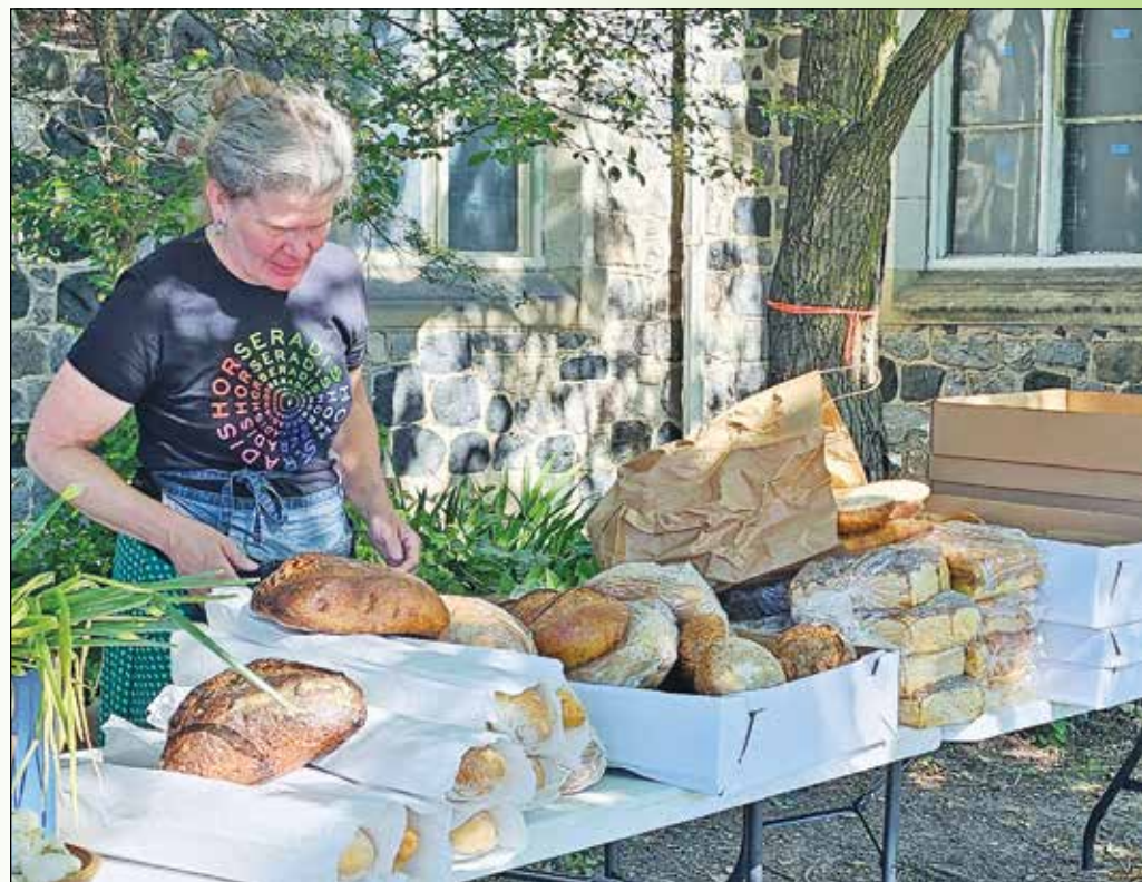
above: A variety of fresh breads and rolls are available at the market each week. top: At the market in early June, radishes, asparagus and strawberries were among the produce available.

"The original stalls from these early markets are still in the courtyard, but no