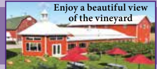
Enjoy a beautiful view of the vineyard

RELAX in our gazebo and sunroom with some friends and a glass of Award Winning Staller Estate Wine