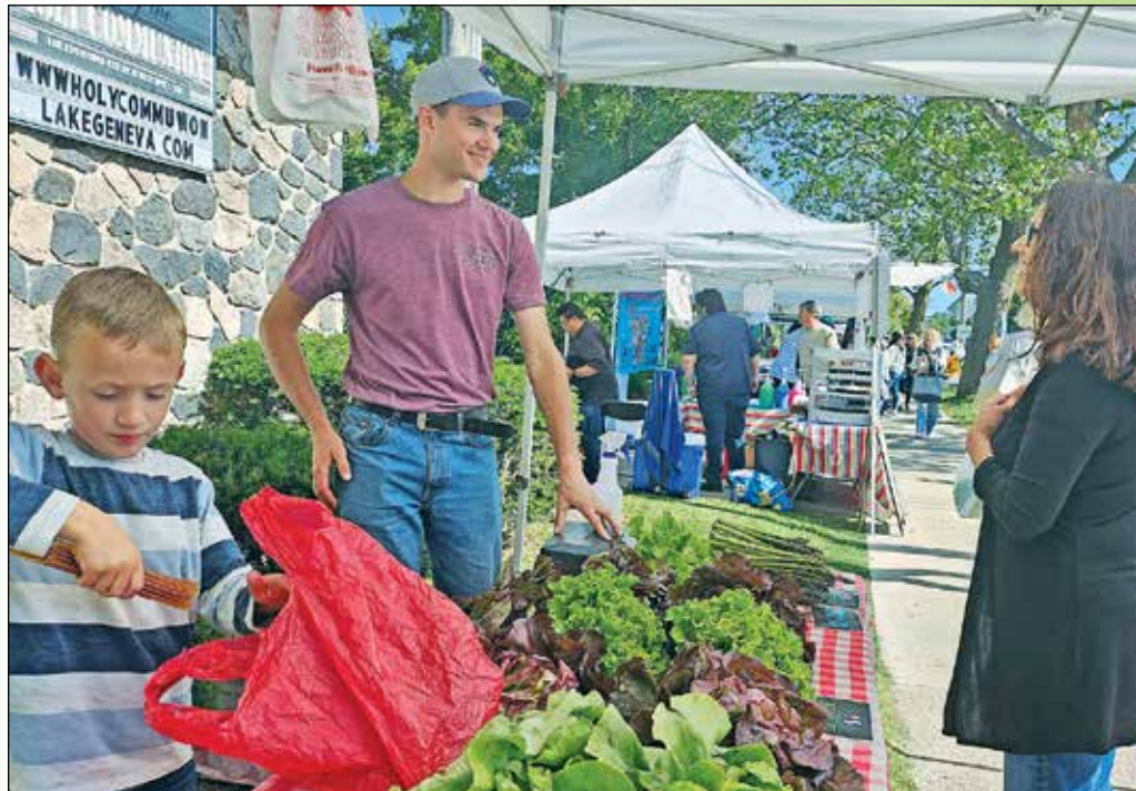
above: Produce at the market varies but among the recent offerings was fresh lettuce, sure to make a summer salad taste even better. top: It's not hard to understand why a variety of locally grown fresh flower bouquets are a favorite of shoppers at the market in Lake Geneva.

SANDRA LANDEN MACHAJ Spirit of Geneva Lakes