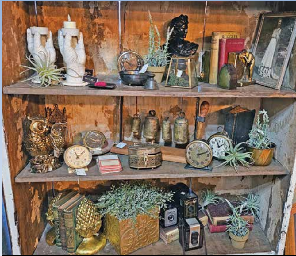
Those who remember a time when alarm clocks had to be wound each day and cameras were not built into your cell phone will appreciate this section at Home Décor.