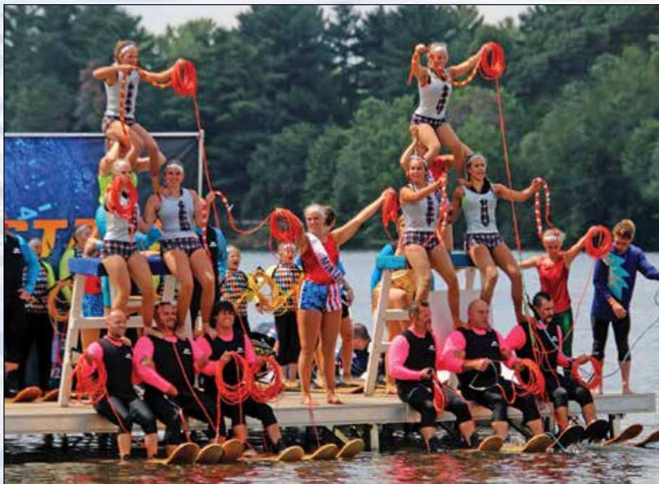
Southern Wakes United team members get into position for the 3-high pyramid that begins with two portions of the large group of skiers on the dock.

The Wonder Lake Water Skiing Show Team presents free to the public on most Fridays through Labor Day Weekend. See the sidebar for details.