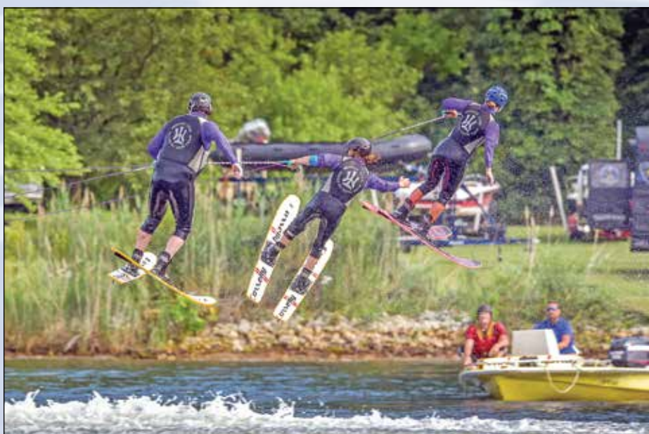
above: This Wonder Lake Ski Club trio flips high into the air without getting in each other's space. top: Pyramids take a lot of practice and proper timing but are always a sight to see.

The Wonder Lake Water Ski Club will take their show on the road to perform at events as long as the water depth is safe. They have done shows in Mundelein and St.