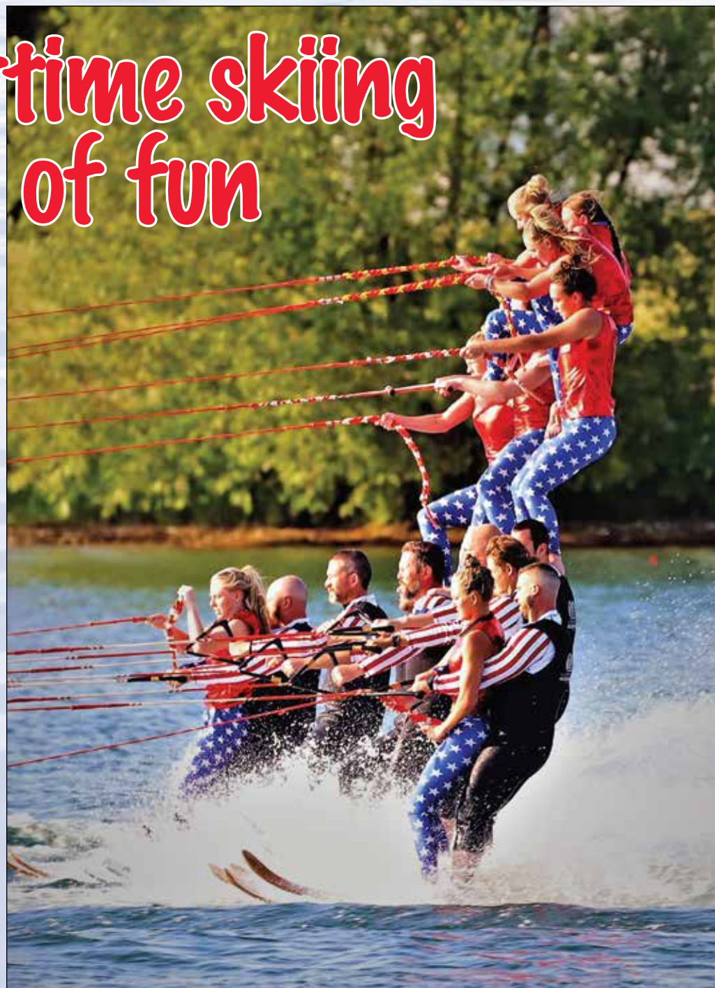
Members of the Southern Wakes United team show off patriotic outfits during a performance.

For Southern Wakes United Water Ski Show Team, 2023 was a special year as they won the Wisconsin State Championship in