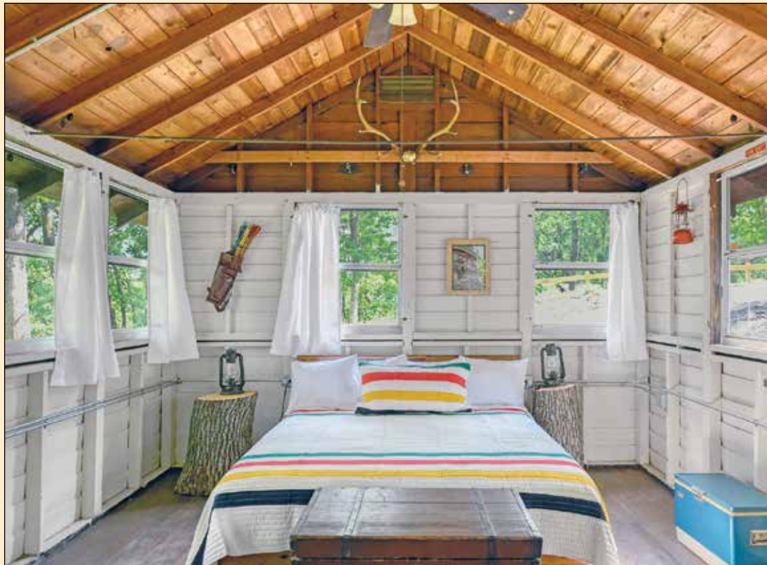
This peaceful, relaxing cabin, all in white with windows all around and a beautiful natural wood ceiling, is an ideal place to relax and unwind.

Other trailers on site – these are individual trailers and not part of a group – are the Oakwood Knoll,