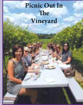
Picnic Out In The Vineyard

RELAX in our gazebo and sunroom with some friends and a glass of Award Winning Staller Estate Wine