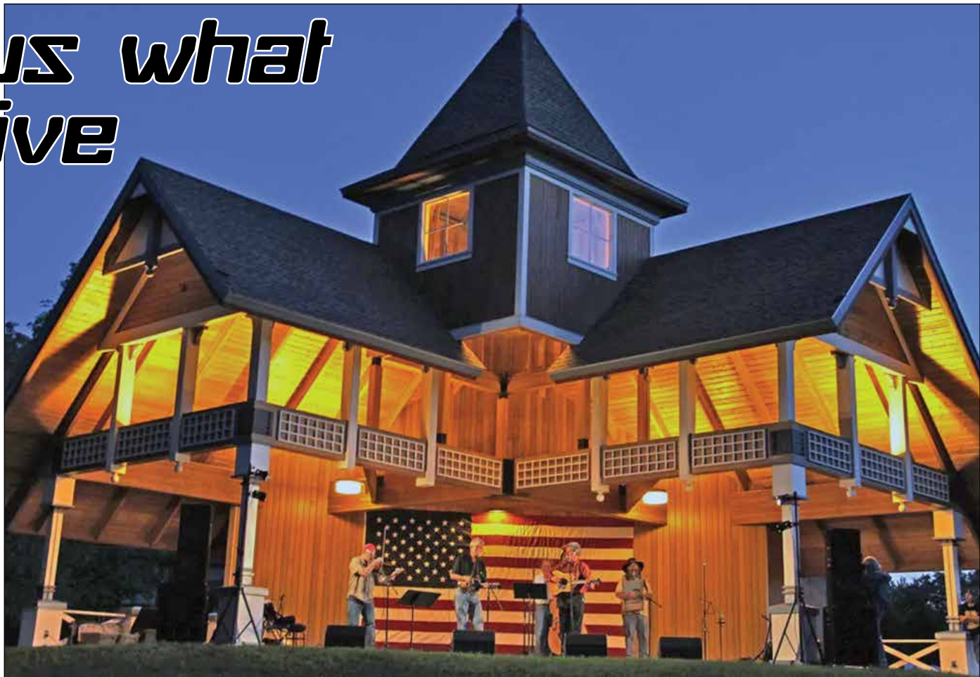
On Saturday, July 13, a parade of classic vehicles will make their way from Lake Lawn Airport through downtown Delavan to Phoenix Park. There, a rally will be held followed by music in the Phoenix Park Bandshell by a Supertramp tribute band.