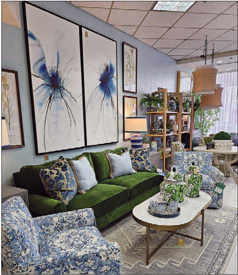
above: Blues and greens in several shades are a trendy color combination as this display shows, with blue patterned chairs, green sofa and large blue flowered prints. at left: Kristi Hugunin, owner of Paper Dolls, takes a short break in one of the living room settings in her store It features neutral furniture and area rug with several colorful accents.