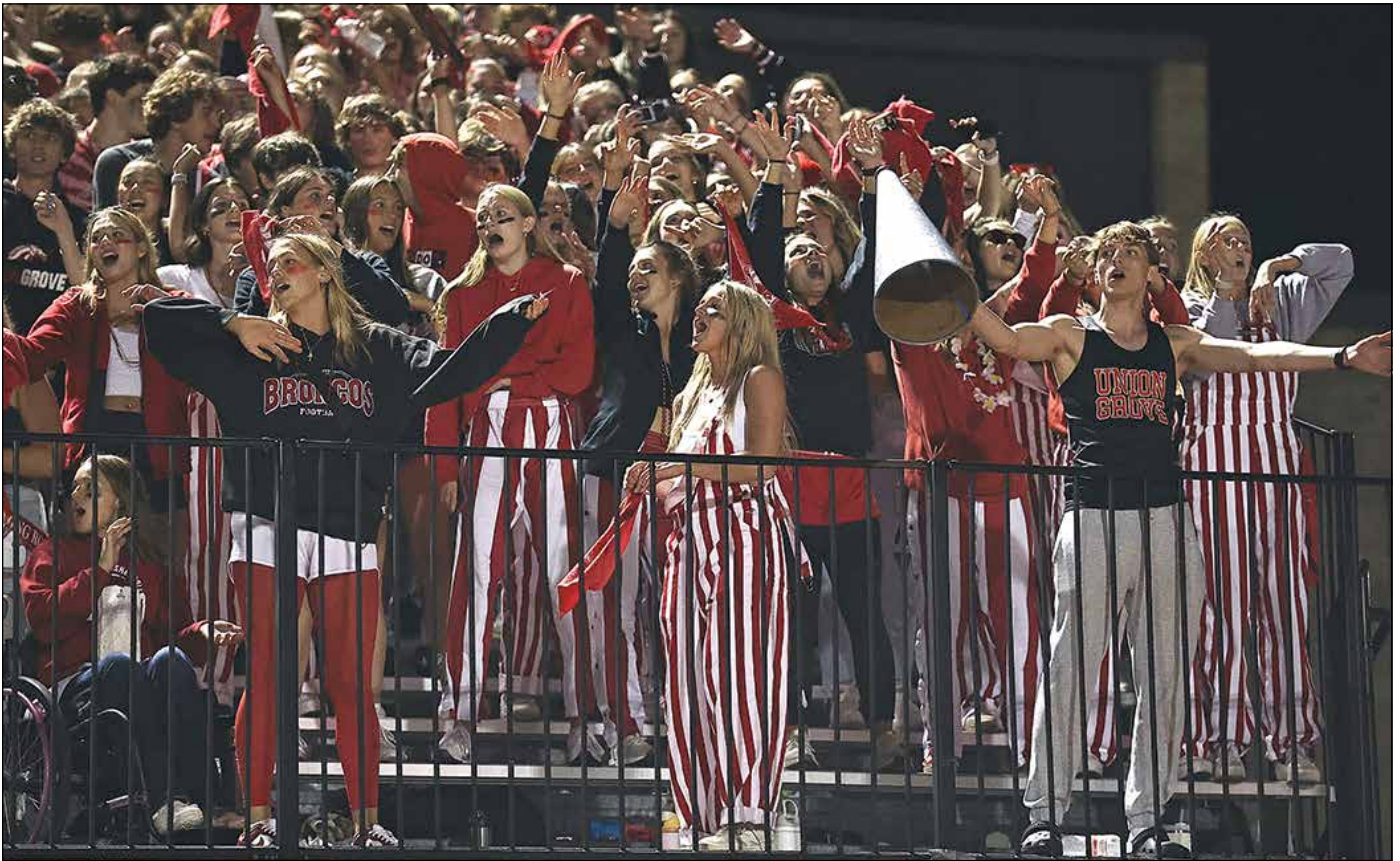
The Union Grove football team rewarded fellow students with a homecoming victory in late September 2023 as the Broncos edged Wilmot 34-26. The student section did its part in bringing energy to the game.