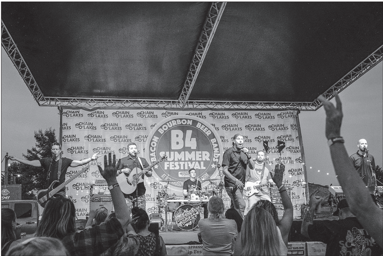
The band Modern Day Romeos performs during the B4Summer Festival at Richardson Adventure Farm in 2023. This year's fest is set for June 8.