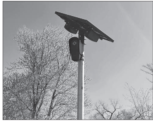
The Village of Antioch PD installed several Flock Automated License Plate Readers (ALPR) recently. The cameras will aid law enforcement to apprehend criminals faster.