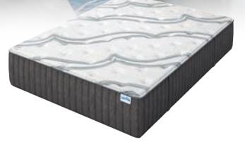
v7 PLUSH 1-Sided No Flip