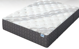
v5 FIRM 1-Sided No Flip