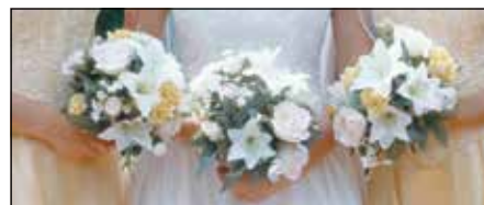
above: Maintaining and distributing a schedule of the day's events, including hair appointments, transportation times to and from the ceremony and reception site, among others, can help couples keep their wedding day timeline on track.