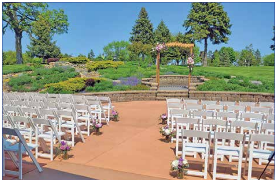
above: The outdoor site for a wedding ceremony at Evergreen features a hill and waterfall, providing an eye-catching background. top: This couple enjoys a stroll through the grounds at Evergreen, one of several areas where wedding photographs can be taken for the collection. opposite bottom: Tables decorated with napkins that compliment wedding colors, along with gold flatware and chairs provide an elegant look. opposite top: A couple kisses with the beauty of the room at Evergreen serving as a backdrop.

Spring Bridal