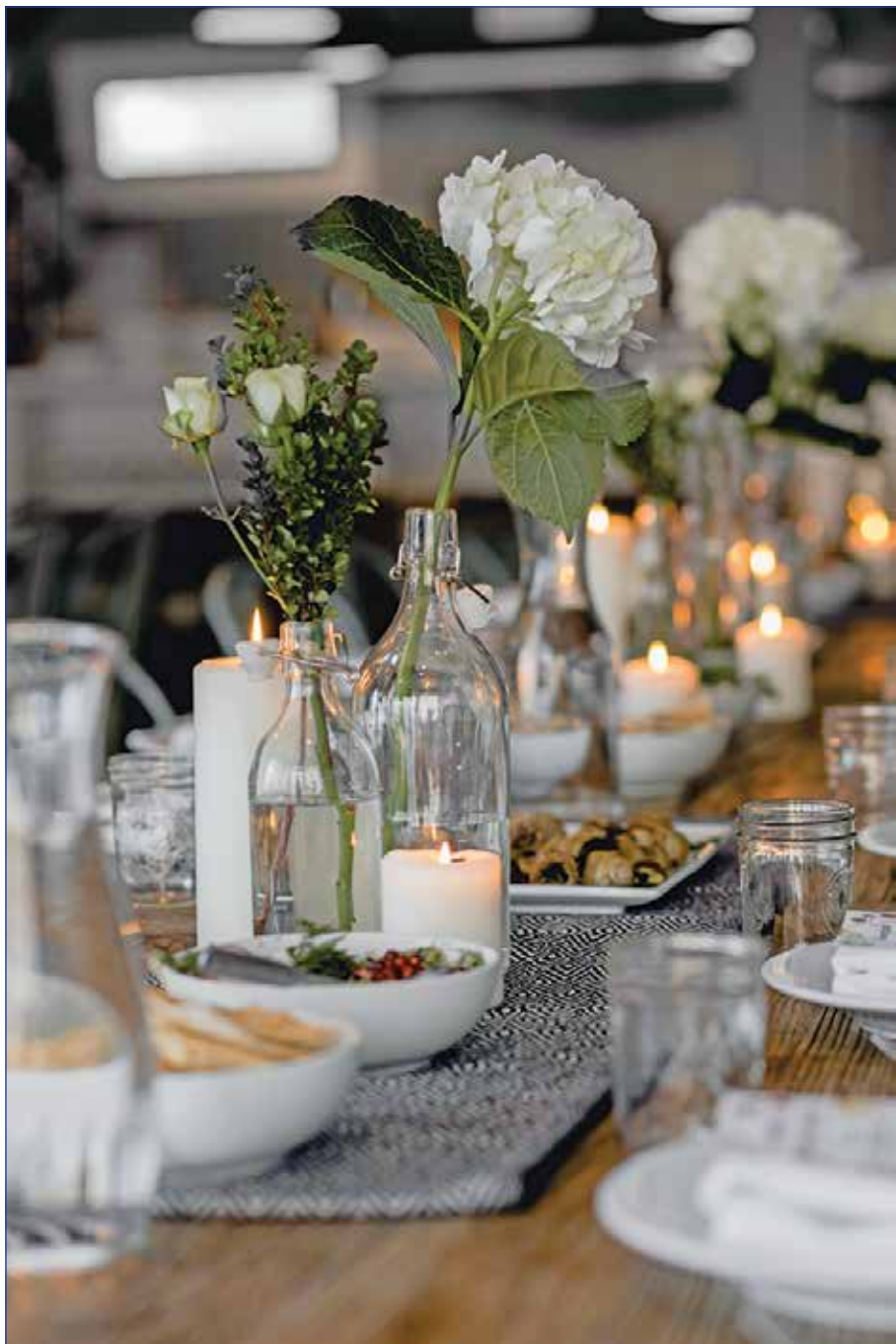
There are several factors couples might want to consider as they aim to provide a tasty meal for their wedding guests. One suggestion is to align the food choices with the degree of formality the wedding will present.