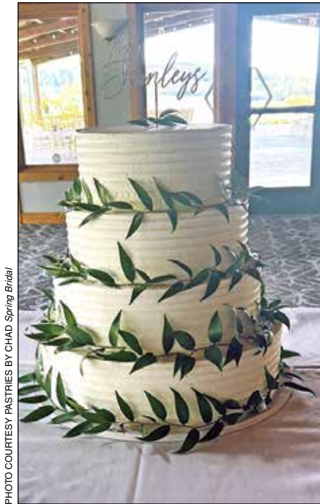
Spring Bridal