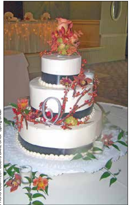
Spring Bridal