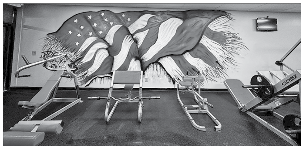
Fitway Fitness, 3224 Main St., is a community gym that hones in on your health and personal fitness needs in a welcoming space.

The gym offers 24-hour access to an array of cardio and weight machines, as well as a substantial variety of free weights through an affordable membership. For details, visit eastroyfitway.com .