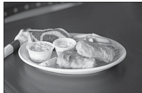
East Troy House Fish Fry