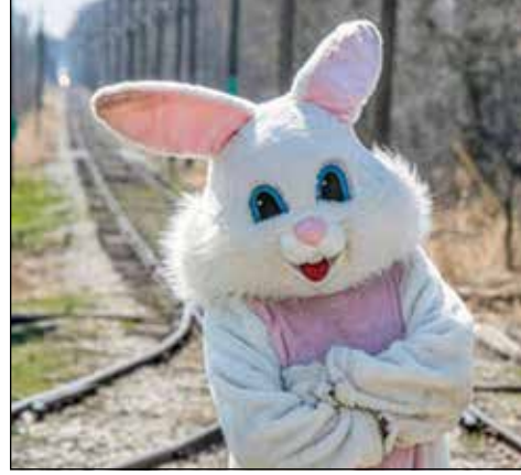
Enjoy some family fun aboard the East Troy Electric Railroad's Bunny Train. Get tickets at easttrotyrr.org .

Tickets are $20 for adults, $16 for children ages 3-14 and $11 for children ages 0-2. For more information, visit easttrotyrr.org .