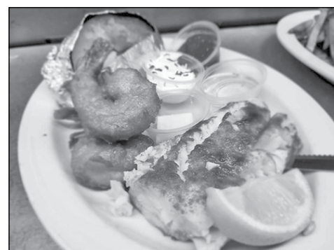
Lulabell's Dockside Fish Fry