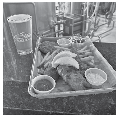
East Troy Brewery Fish Fry

Call (262) 642-5264 to place your order or reservation today. For more information, visit lulabellsdockside.com .