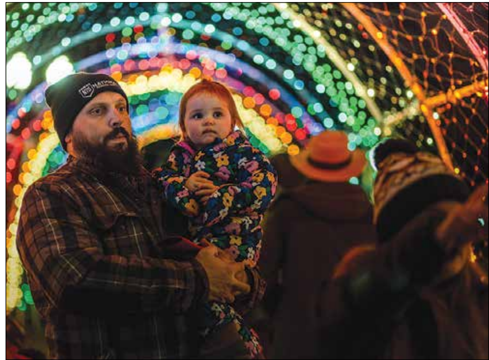
CAH PRODUCTIONS Good Neighbors