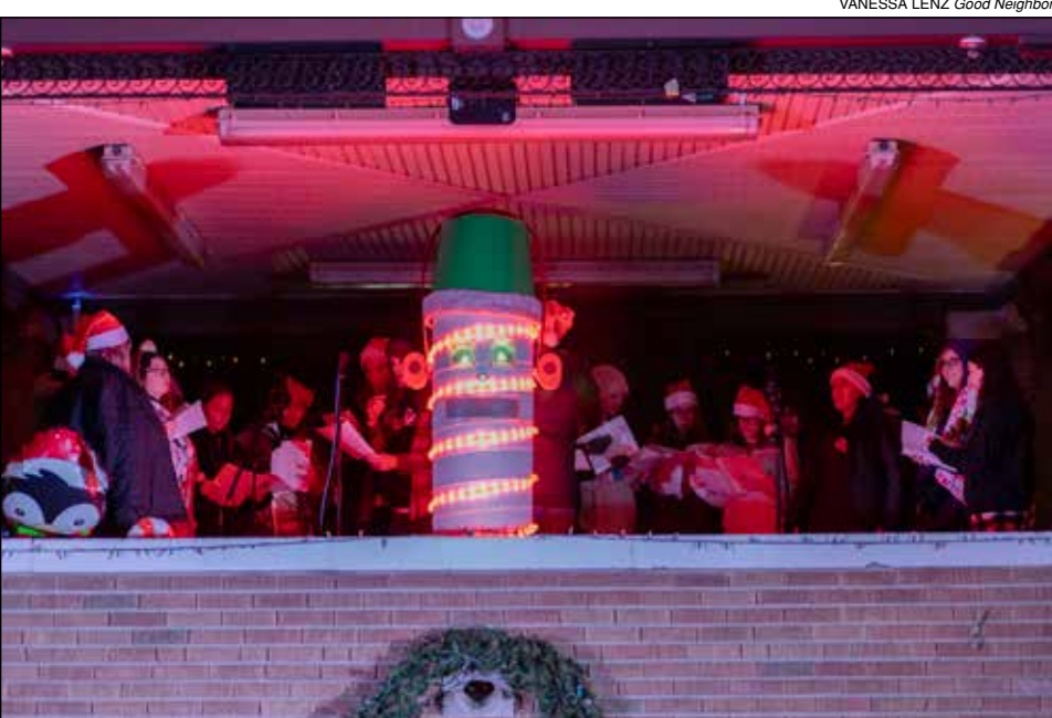
CAH PRODUCTIONS Good Neighbors