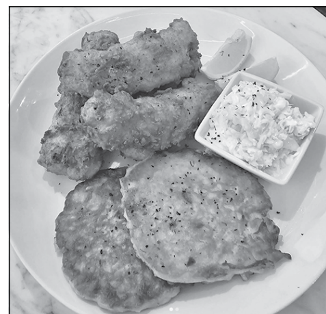
Alpine Valley Resort Fish Fry