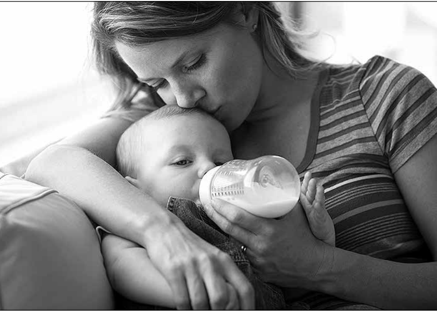
According to experts, women who are pregnant or who have just given birth experience a myriad of emotions. They can range from mild symptoms marked by mood swings to rare cases that can be more severe. It's important family and friends are aware that these conditions can occur and encourage the woman seeks further care if warranted.

Symptoms include refusal to eat; inability to cease activity and frantic energy; extreme confusion; memory loss;