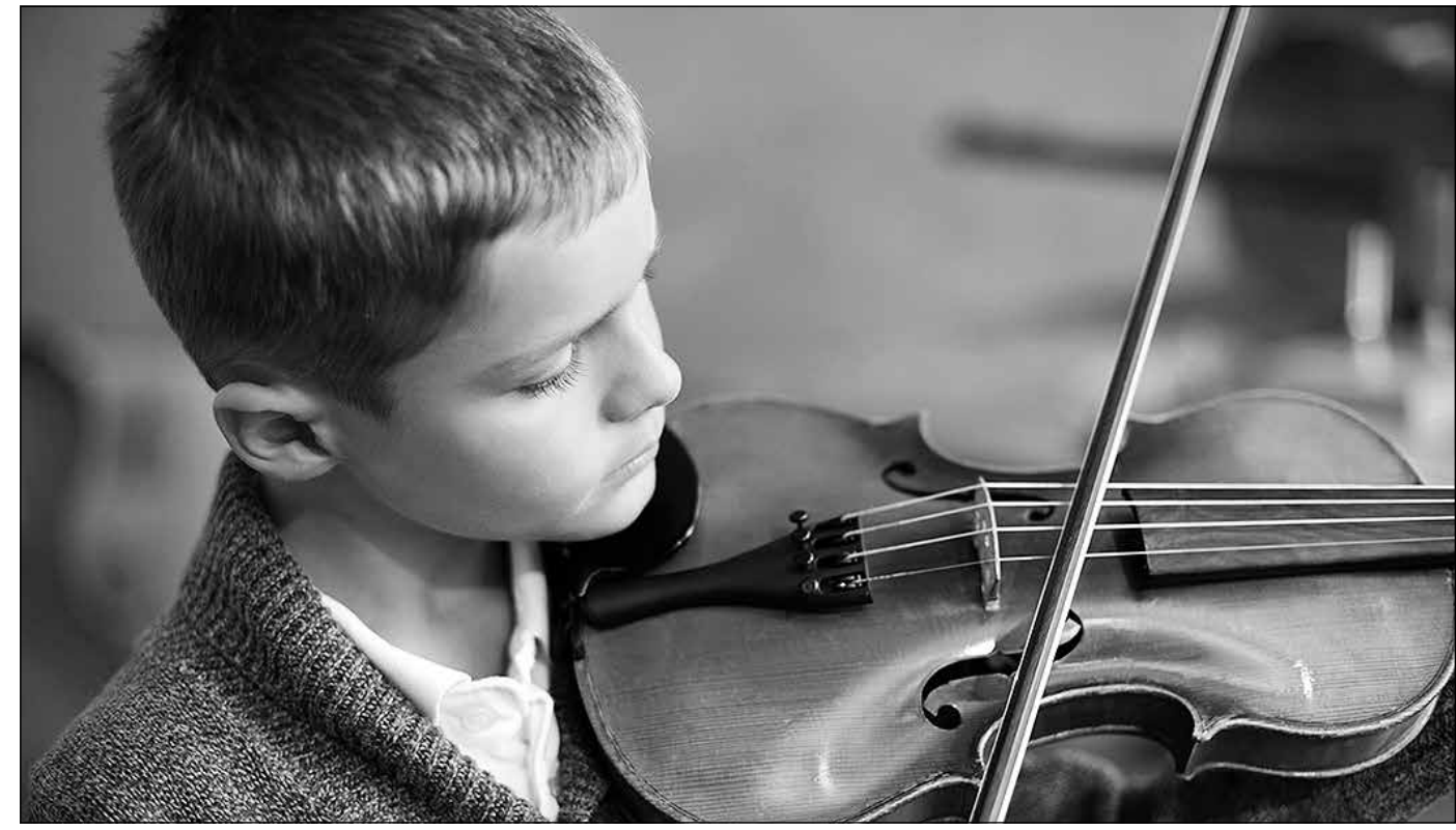
There are plenty of students who are not sports enthusiasts but can still fill their after-school hours with activities that can help cultivate leadership, teamwork, time management skills, confident and more. There are a variety of options available including culinary arts, band and chorus, arts, coding and programming, foreign language clubs and theater.