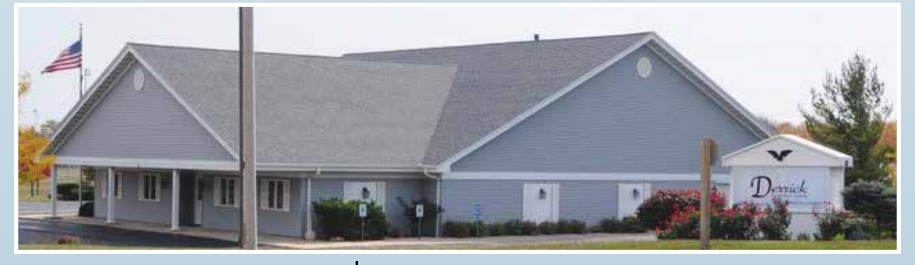
1997-Present | 800 Park Drive, Lake Geneva