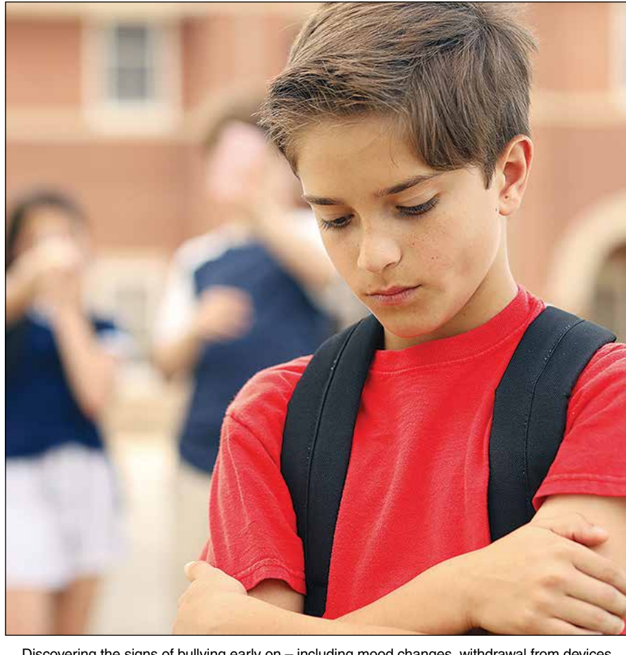
Discovering the signs of bullying early on - including mood changes, withdrawal from devices, reluctance to go to school and changes in friendships - may help students get the help they need Focus on the Family