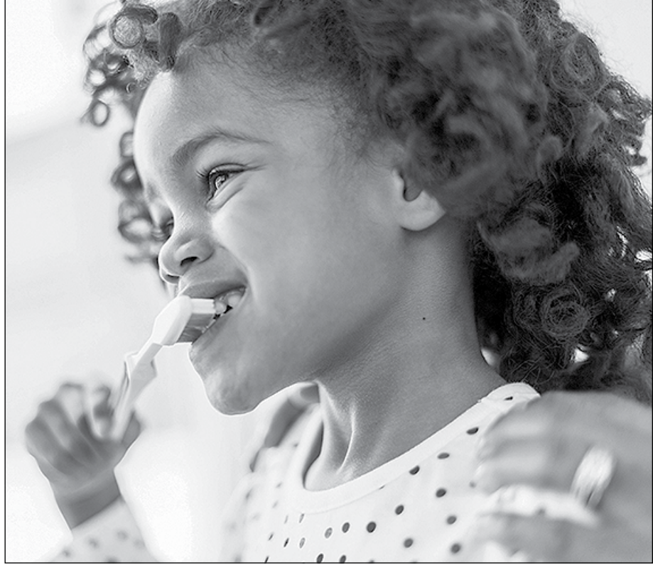
Kids may or may not embrace the morning and nighttime routine of brushing their teeth, no matter how hard parents try to relate the benefits of doing so. But making oral hygiene a priority in childhood could potentially reduce the risk for various diseases as adults.

For more information, visit the Child Welfare Information Gateway website at www.childwelfare.gov or call 1-800-394-