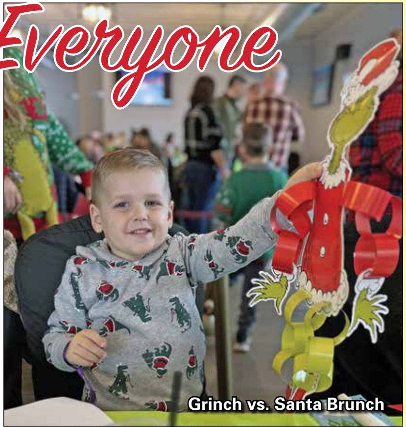
Grinch vs. Santa Brunch

Calling all wizards, witches, and muggles! Antioch's Wizards Weekend Day is celebrated on Saturday, June 15th. It's a full day packed with magic for all ages. In 2024 we are doubling the fun for all magical beings! Register your magical students for our Kids School of Magic and experience Magical Moments and a Scavenger