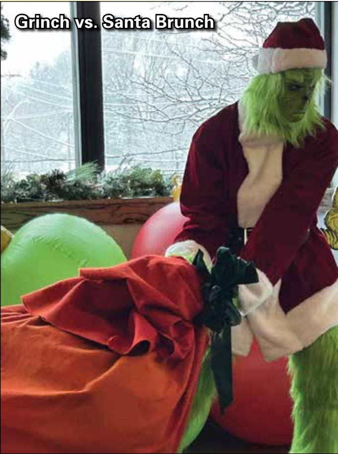
Grinch vs. Santa Brunch