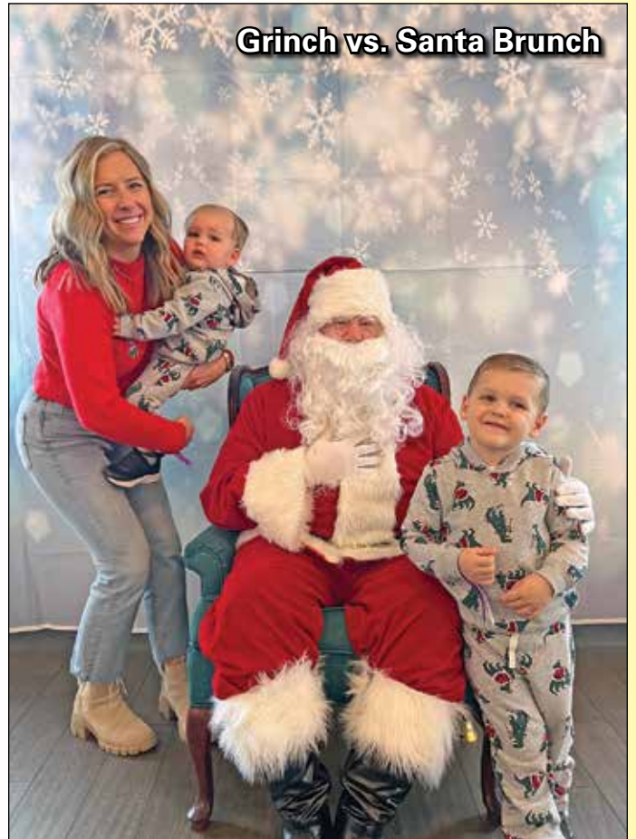
Grinch vs. Santa Brunch