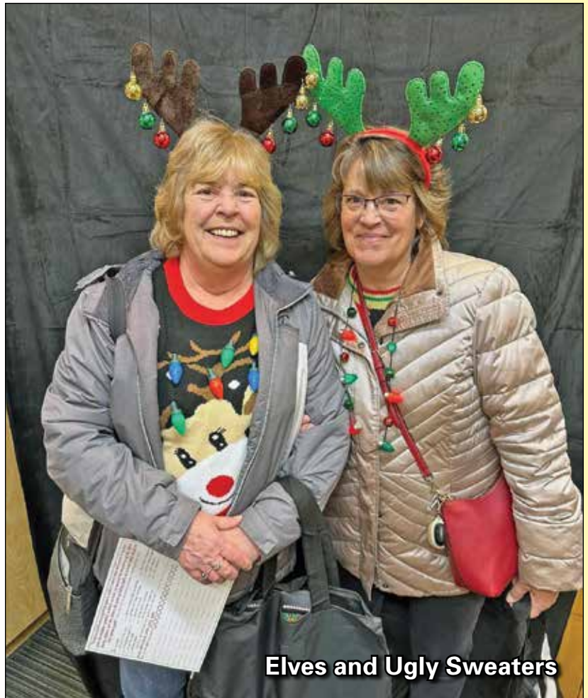
Elves and Ugly Sweaters