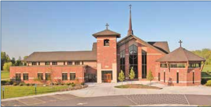
"Growing Together in the Eternal Gospel"

Sundays 9:30 a.m. Saturdays 5:30 p.m. (Memorial Day-Labor Day) Thursdays 6:30 p.m.