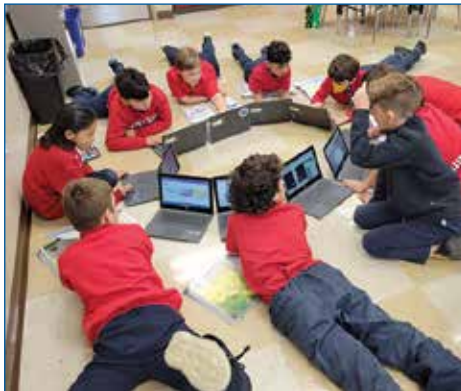
ST. BEDE CATHOLIC SCHOOL

If not, come check out all the great things happening at St. Bede School