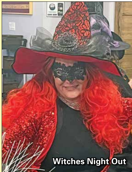
Witches Night Out