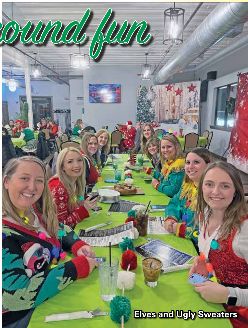
Elves and Ugly Sweaters

And after a day of shopping, treat yourself to the perfect dining experience. Antioch has it all, from local hot spots and sophisticated dining to fun eateries. Whether you're craving burgers, pizzas, pasta,