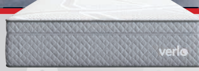
v5 FIRM 1-Sided No Flip