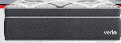
v7 PLUSH 1-Sided No Flip