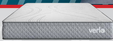
v3 PLUSH 1-Sided No Flip