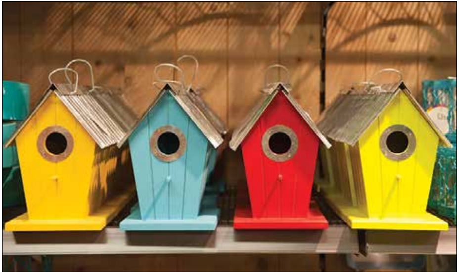
Hang a few colorful and unique birdhouses in your backyard. They provide color and whimsy to the winter landscape and will be ready for your feathered friends to move in when spring arrives.

The tree provides some extra greenery in the often-drab winter landscape as well as shelter for the visiting birds. Then add a few of those birdseed ornaments for added food and winter decoration.