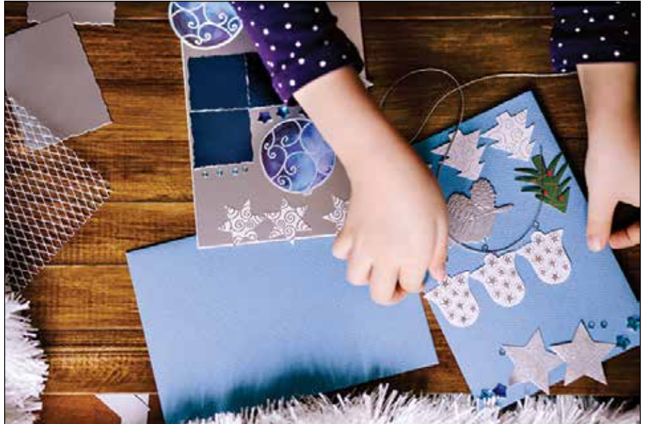
From cute and quirky to stylish and sophisticated, a few simple materials and a little imagination are all that's needed to make each Christmas gift as unique as its recipient.

Increase the wow factor of each package by adding an embellishment that doubles as an extra gift.