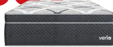
v7 PLUSH 1-Sided No Flip