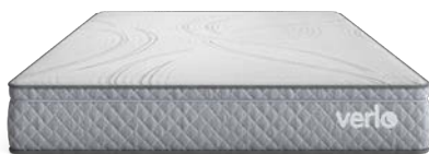
v3 PLUSH 1-Sided No Flip