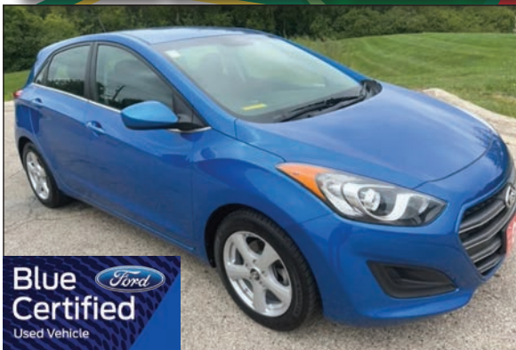
Blue Certified Used Vehicle 2017 HYUNDAI ELANTRA GT FWD , 2.0L DOHC, split folding rear seat, perimeter approach lights, NEW brakes. #33154B WAS $16,995..... MARKET BASED PRICE $10,995*

WE ARE OFFERING THESE VEHICLES AT HUGE SAVINGS BEFORE WE TAKE THEM TO AUCTION