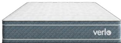
v1 FIRM 1-Sided No Flip