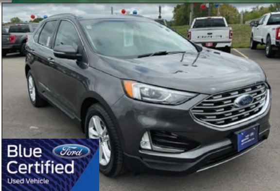
Blue Certified Used Vehicle 2020 FORD EDGE SEL AWD , 4cyl., parking camera & sensors, heated seats. #P2878 WAS $24,995..... MARKET BASED PRICE $19,779*