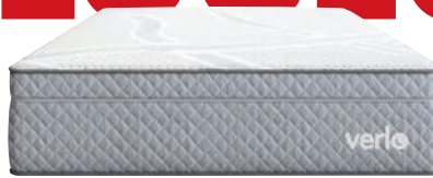
v5 FIRM 1-Sided No Flip