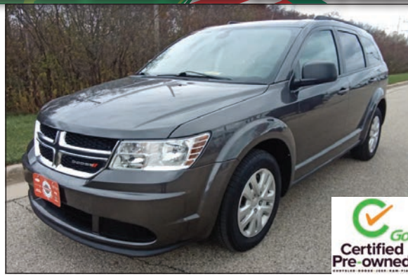
Certified Pre-owned 2018 DODGE JOURNEY SE FWD , 4cyl., 3rd row seats, perimeter approach lights, new brakes. #42563N WAS $24,995..... MARKET BASED PRICE $14,995*