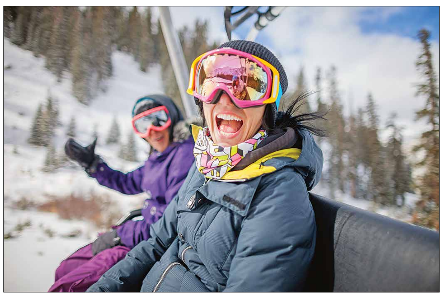
FILE PHOTO Fall Fun Guide