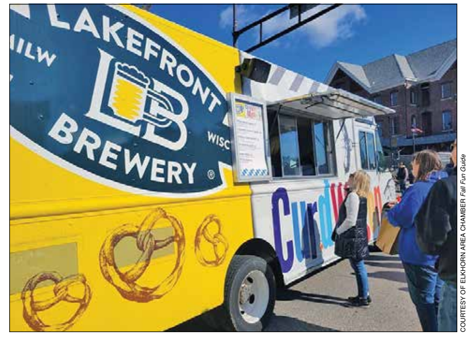
above: Oktoberfest in Elkhorn features a craft and vendor fair in Veterans Park, a variety of German and local food options, live entertainment on a stage downtown and more including an all around town wine/beer tasting event, a 5K run/walk and a classic car show. top: Autumn's canopy of colors provides a special experience for bicyclists along the White River Trail or one of the many Rustic Roads in the area.