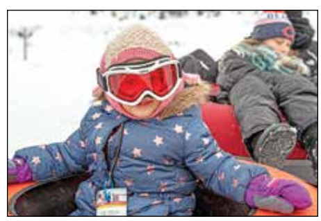
Tubing is a fun activity for all young or old. The tubing hill at Wilmot Mountain has divided lanes to protect the tubers from crossing into each other's space, making it very safe.

Alpine offers classes for beginners to well-seasoned skiers and riders.