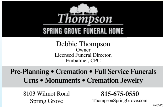
Spirit of the Lakes

Riding the River Trail on a bicycle is a favorite summer activity for many. The trail offers a smooth, gravel path that's bike friendly.