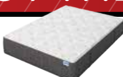
v3 PLUSH 1-Sided No Flip

$499 TWIN SET $599 FULL SET $899 KING SET