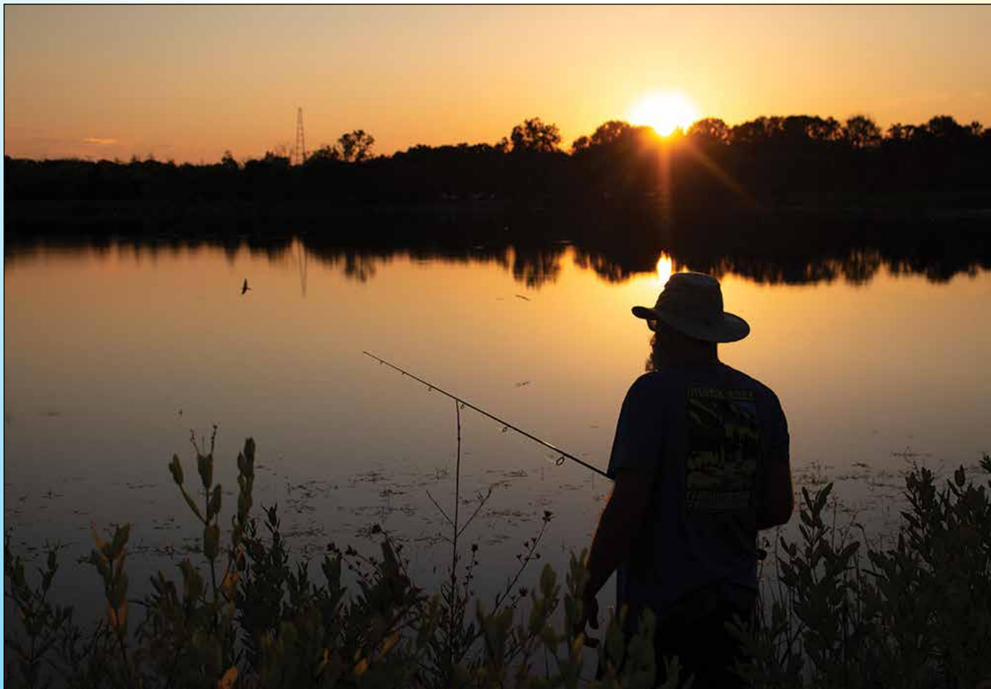
As the sun sets, this fisherman casts his line from shore. It's often said that fish bite more at daybreak and sunset.

For more information, visit www.lcfpd.org or call 847-367-6640. The preserves can also be found on Facebook and Twitter.