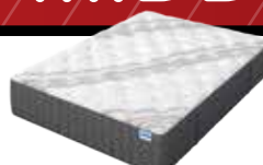
v5 FIRM 1-Sided No Flip

$749 TWIN SET $899 FULL SET $1399 KING SET