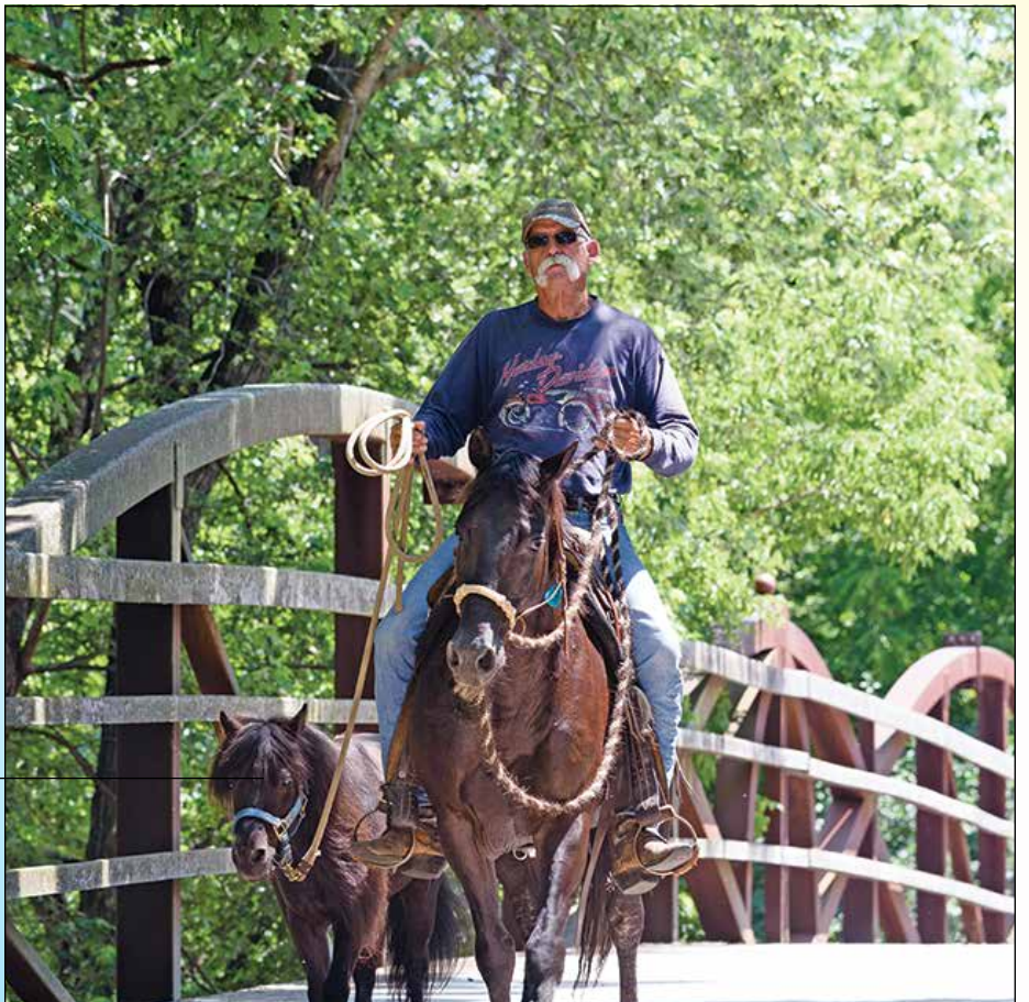
Spirit of the Lakes

above: The savannah is a great place for a walk on a beautiful summer day. at right: Spend the day on the trails riding a horse – or as this gentleman is doing, ride a horse and walk a pony at the same time.