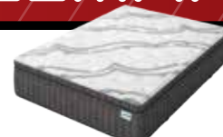
v7 PLUSH 1-Sided No Flip

$1049 TWIN SET $1349 FULL SET $1999 KING SET