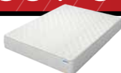
v1 FIRM 1-Sided No Flip

This CUTS OUT THE MIDDLEMAN to keep prices affordable for you.