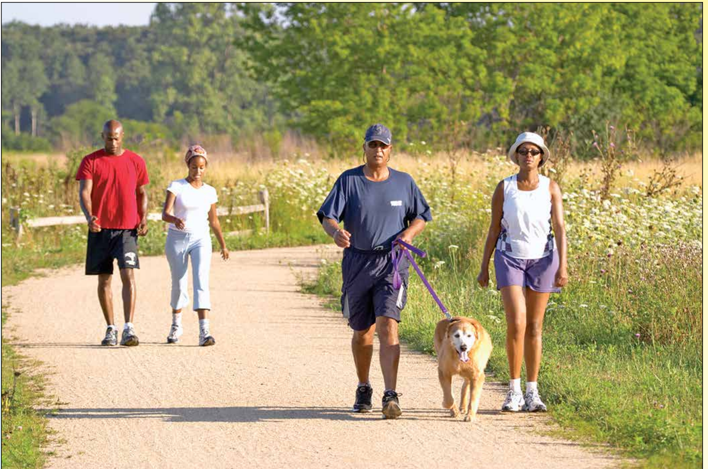
Spirit of the Lakes

riders visit the horseback riding section on the website.