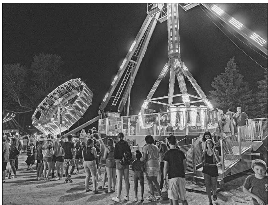
The Racine County Fair features a carnival with rides and games. This year's fair opens Wednesday, July 26, at the fairgrounds in Union Grove.