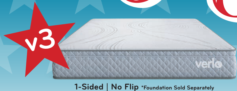
1-Sided | No Flip *Foundation Sold Separately