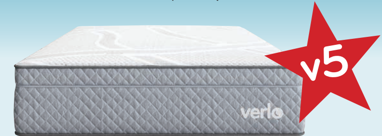
1-Sided | No Flip *Foundation Sold Separately