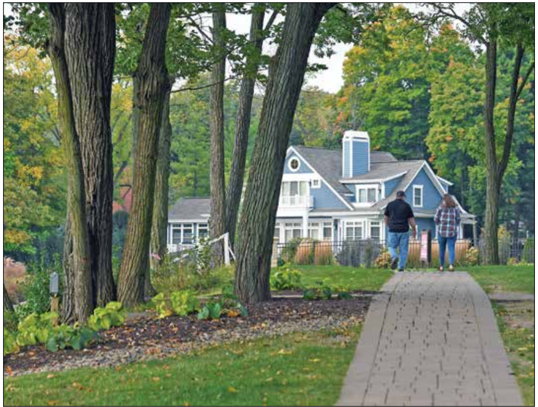
above: Each section of the path is maintained by the family bordering the property.

These wealthy Chicagoans made their way to the shores of Geneva Lake after the Chicago Fire of 1871, remember the one that was said to be started by Mrs. O'Leary's cow? At that time the citizens of Chicago looked for an escape for their