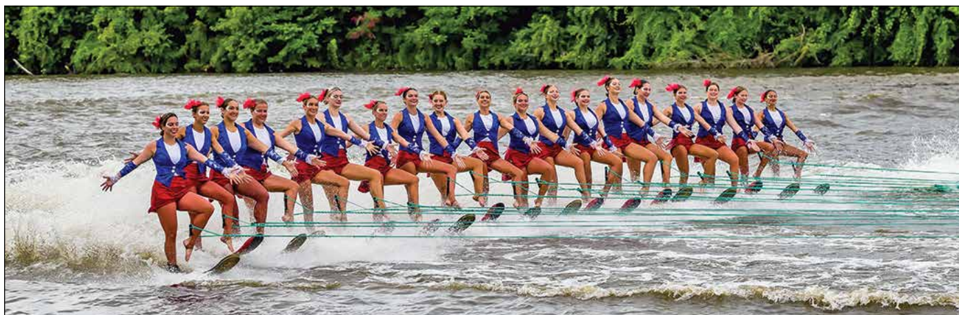
Lake Living