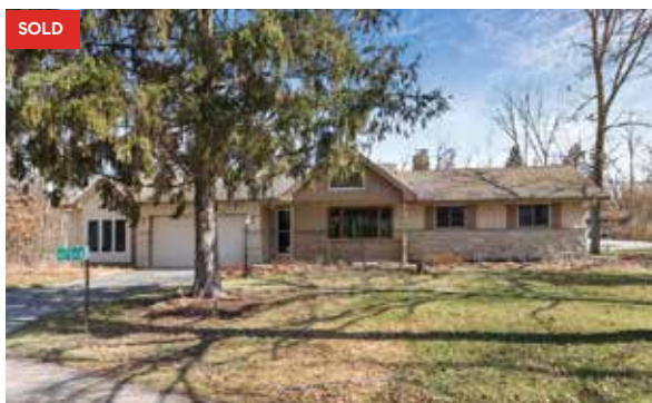
N7544 Cool Hill Ct • La Grange • $550,000