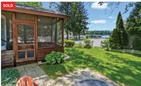
W5229 Surfwood Dr, Unit 8 • La Grange • $180,000