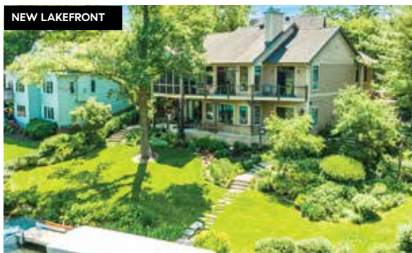
W5672 Ridge Rd • Elkhorn • $1,869,000