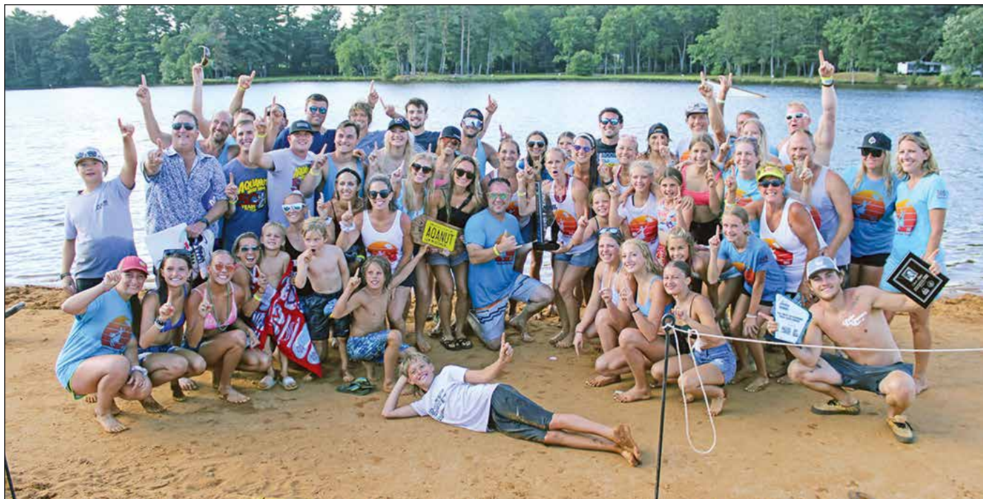
Lake Living