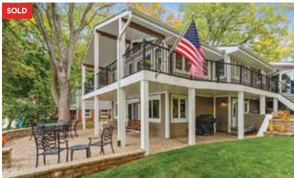
N7630 Pleasant Point Cir • La Grange • $1,650,000