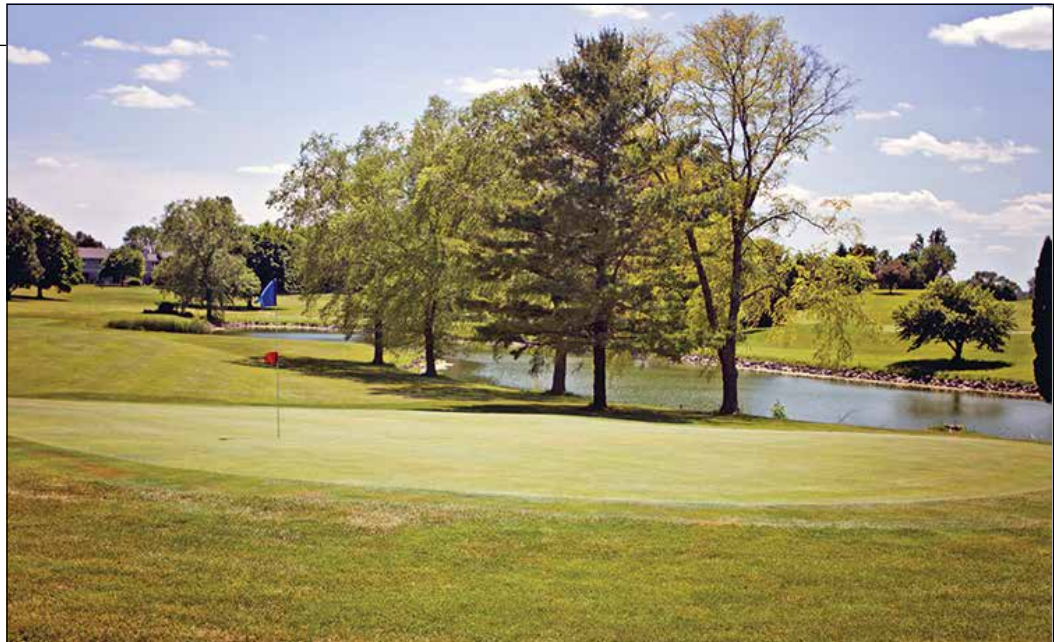
The green at No. 9 South at Delbrook Golf Course has both water and trees in play.

Clubhouse hours are Monday through Thursday, 8 a.m. to 7 p.m., Friday 11 a.m. to 7 p.m., Saturday 7 a.m. to 7 p.m. and Sunday from 7 a.m. to 2 p.m.