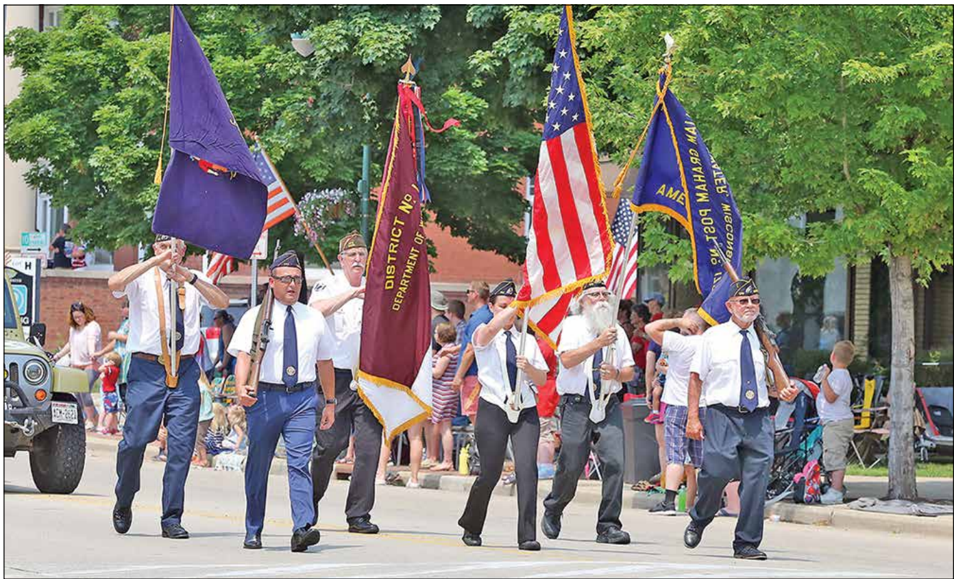
Whitewater's Fourth of July parade steps off at 10 a.m. July 4. The annual parade begins at Lincoln School on Prince Street and proceeds down Main Street and ends at Fremont Street.