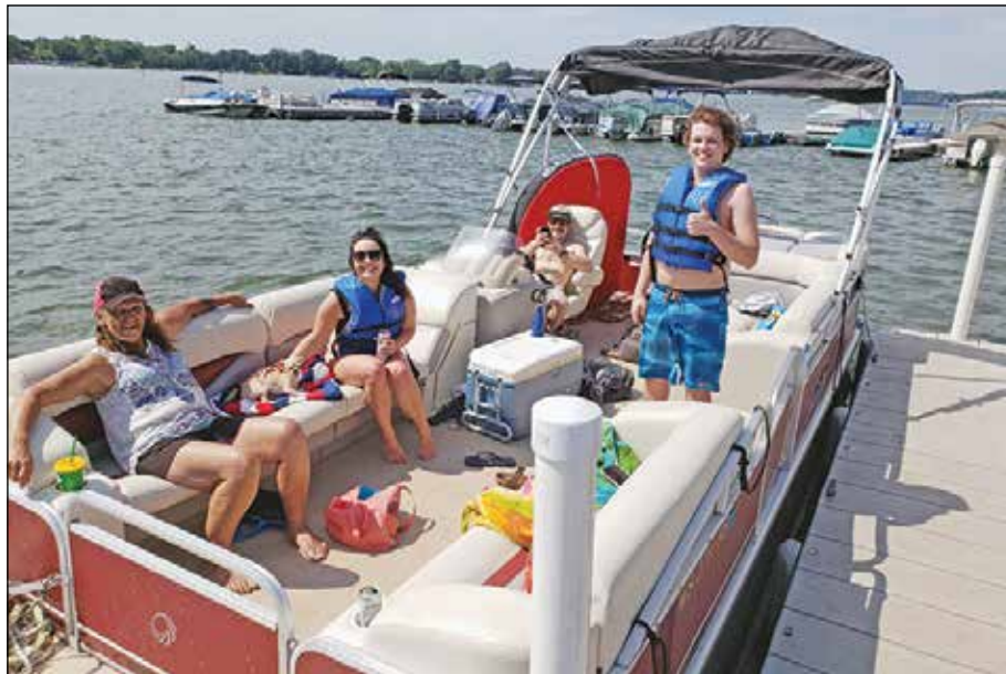
The Breeze