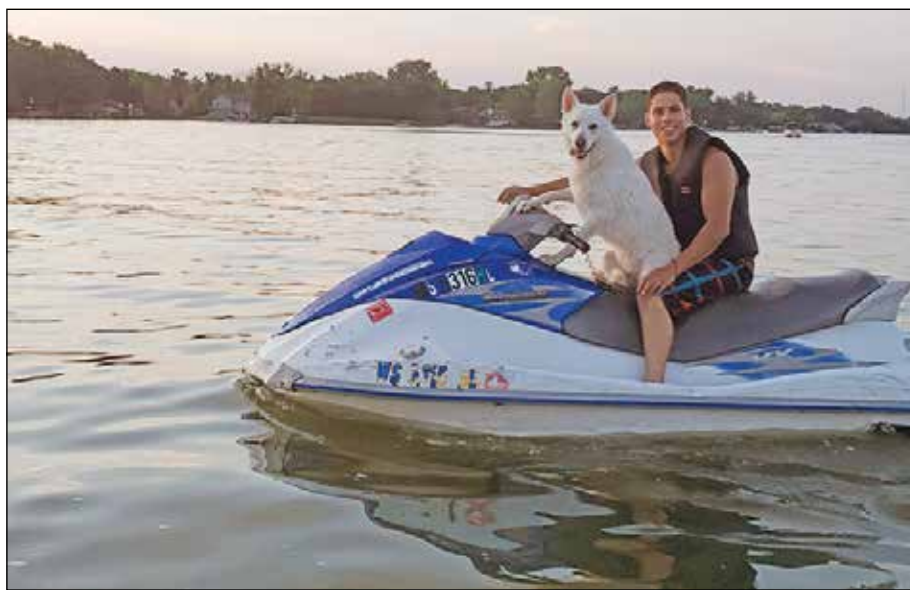
The Breeze

Kayaks are fun to enjoy on the water and they will take you as fast as your arms can paddle or the wind and the waves can propel you. Kayaks are easy to maneuver and a great way to enjoy the peace and tranquility of the water on a nice summer day.