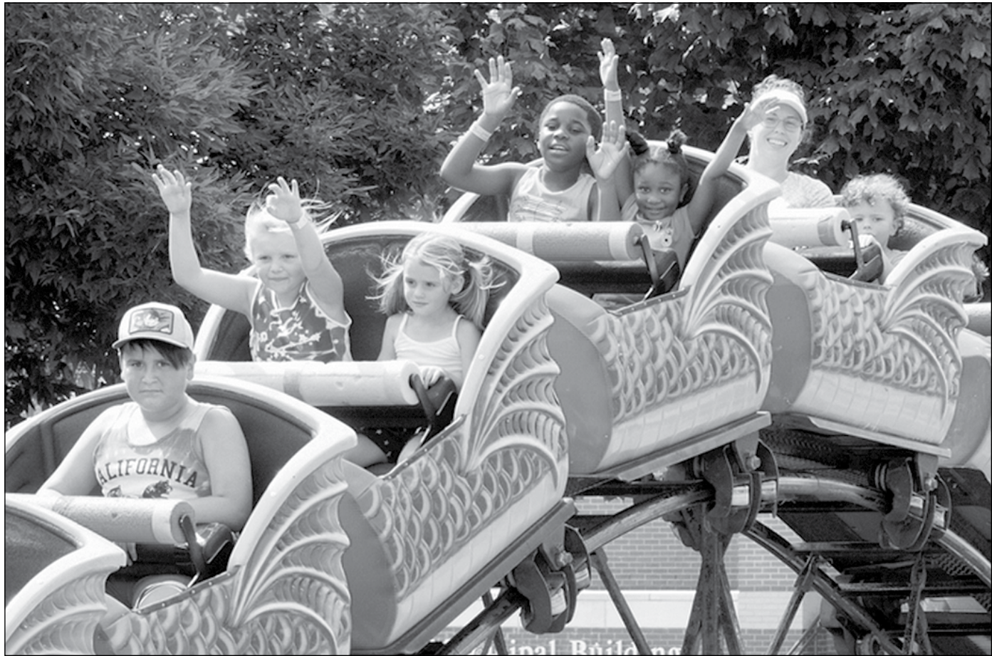
The carnival and amusement park rides are always a big draw for Whitewater's annual Fourth of July festival. The festival also features a car show, Whippet City Mile run, parade, fireworks, food and more.

This year's festival is July 1 to 4 at Cravath Lakefront Park, 312 Whitewater St.