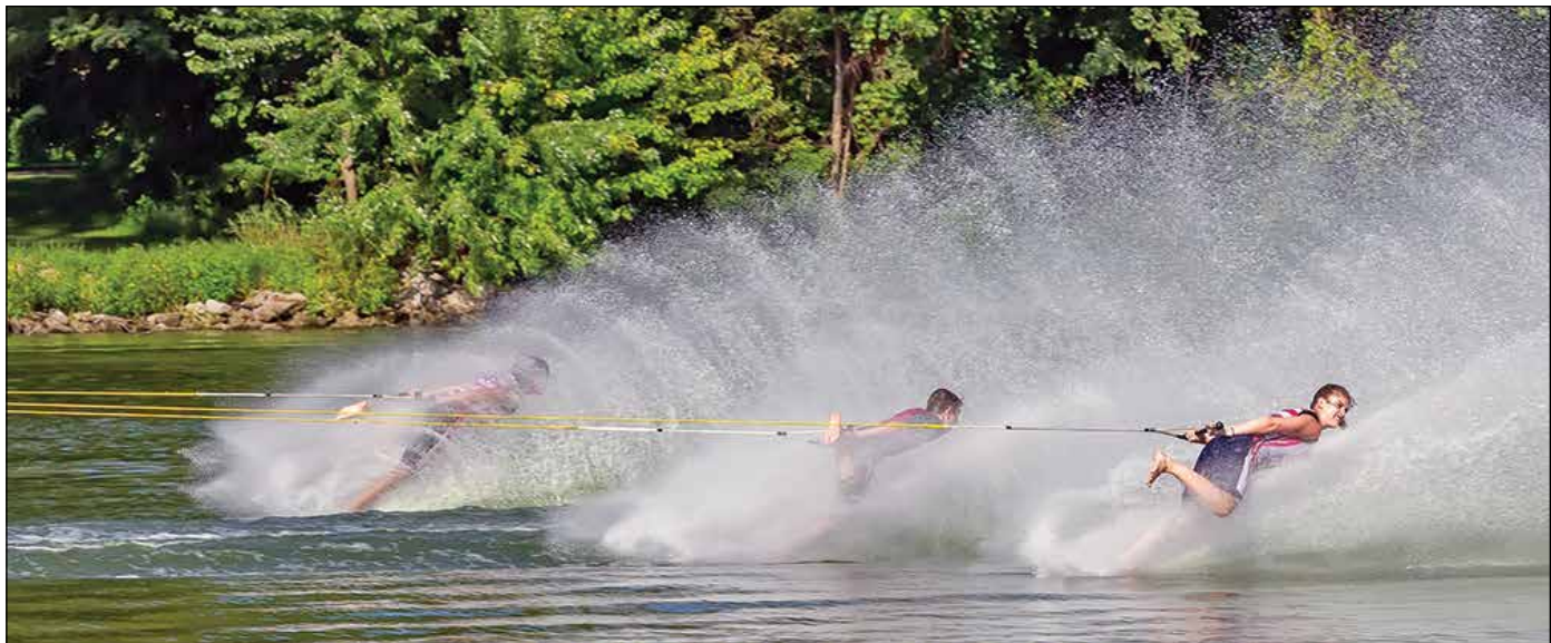
above: Skiing backwards while barefoot in the 2021 National competition, these skiers perform beautifully. The spray of water adds to the beauty of their skiing. below right: One of the many tricks the advanced skiers can perform on the Aquaducks. This skier turns upside down while attached to a ski board. below left: Lifting a partner high above while maintaining his balance on his skis requires skill and balance and skill on the part of both participants in the Aquaducks.

The Breeze