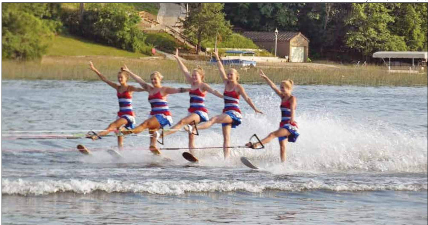
The Southern Wakes United Water Ski Team member perform in a patriotic-themed formation in celebration of the Fourth of July. opposite: “Pebbles and Bam Bam” steal the show during a performance by the Southern Wakes United Water Ski Team show last summer.

The Breeze