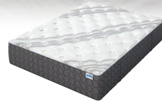
v5 FIRM 1-Sided No Flip