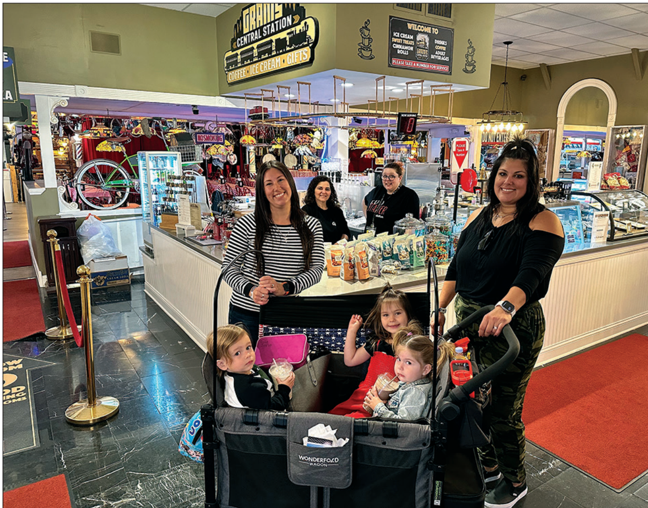
Moms are invited to celebrate Mother's Day at the Volo Museum this year, with complimentary massages, live acoustic music, Mom-mosas and more on tap May 13-14.

For other details, visit volo-fun.com, find Volo Museum on social, or call 815-385-3644.