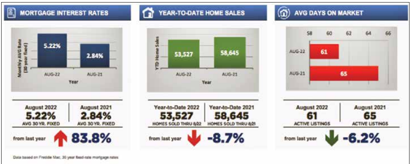
Mortgage rates continue to climb and the number of homes sold continues to decline in Wisconsin.