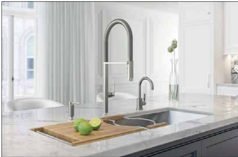
Elegant fixtures add a touch of class to kitchen sinks.