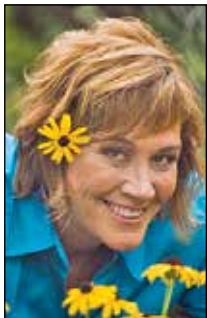
By MELINDA MYERS Contributor

It's never too early to start planning new additions to this year's gardens and containers. Start compiling your list now so you are ready to place your seed order or buy plants early when the selection is the greatest.