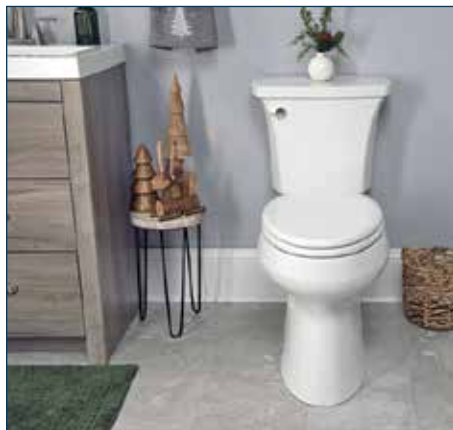
With a few simple upgrades, your guest bath can become a minispa to surprise and delight your guests.

Of course, you can always add a new coat of paint, or change the towels, shower curtain