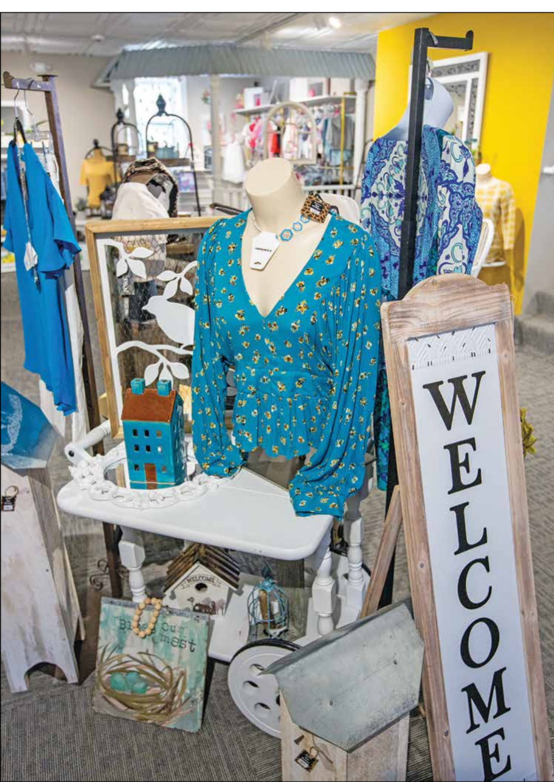
Square Side Boutique, a popular consignment and resale shop, recently expanded on the East Troy Village Square giving shoppers more space to thrift one-of-a-kind treasures from your favorite women's and children's brands.