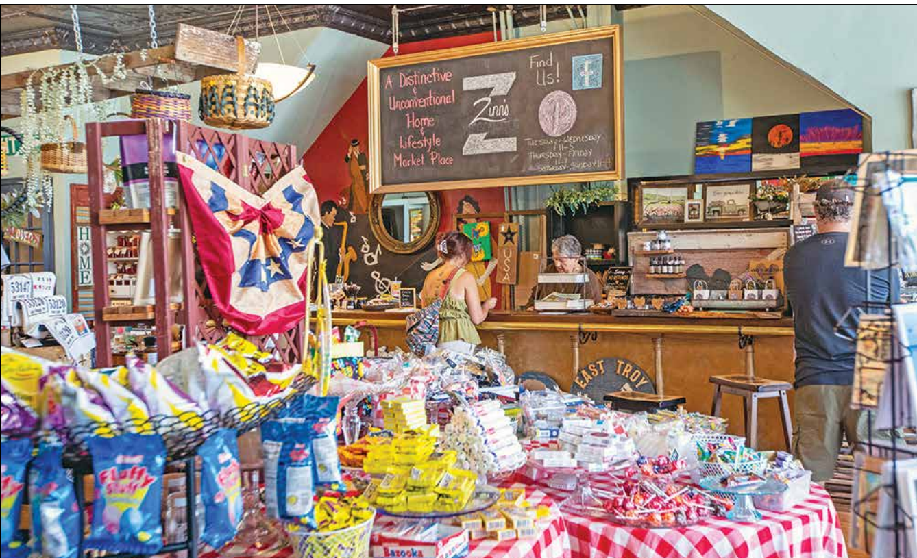
Zinn's on the Square puts focus on curating goods made by local artisans.

Open Tues., Wed., Thurs., Fri. from 10 a.m. to 6 p.m., Sat. from 9 a.m. to 4 p.m.