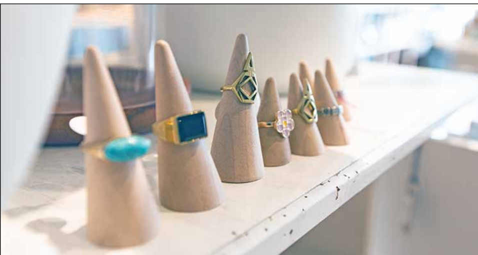
Showcasing a mix of big city and Wisconsin brands, Home on the Square offers a beautiful high-low blend.