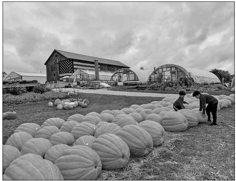
What better way is there to enjoy the change of seasons than stocking up on pumpkins and produce at Bowers Produce, W490 WI-20.