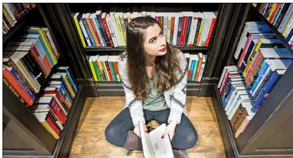
InkLink Books, East Troy’s first bookstore, celebrated its fifth anniversary July 5, and has become a destination for shoppers visiting the East Troy Village Square.