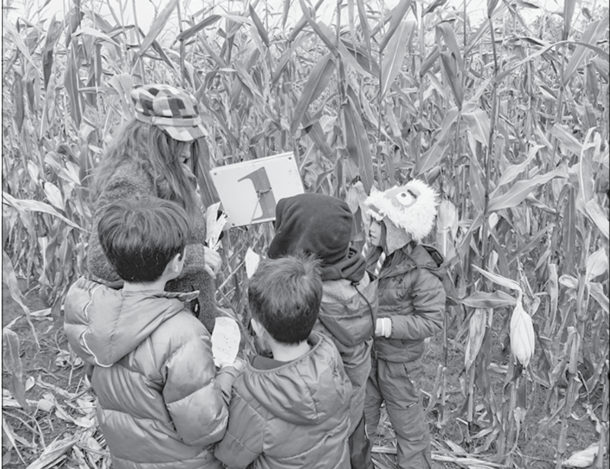
East Troy makes it easy to make the most of the fall season. top right: The Elegant Farmer's Harvest Festival features a corn maze, apple picking, hayrides, apple cider donuts and more. top left: The East Troy Electric Railroad, one of East Troy's most famous attractions, will offer weekend rides through Oct. 30.