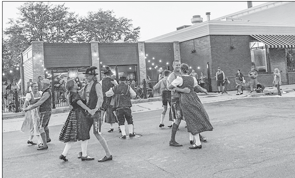
East Troy Brewery will be hosting its annual Oktoberfest event on Saturday, Sept. 17 featuring a special Oktoberfest beer release, German Dancing by D'Oberlander and more.