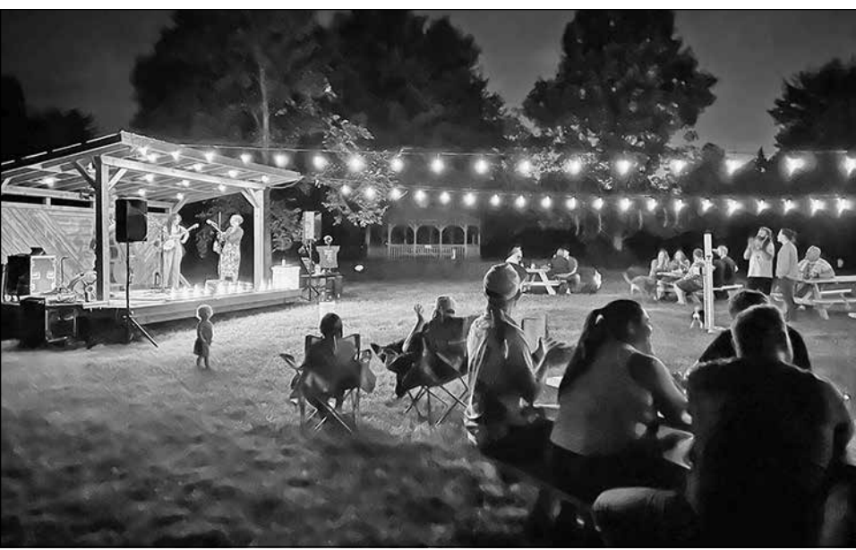
The Hive Taproom is buzzing with events this fall, featuring live music every Saturday night, Thursday Night Trivia, Brewery Tours and more.