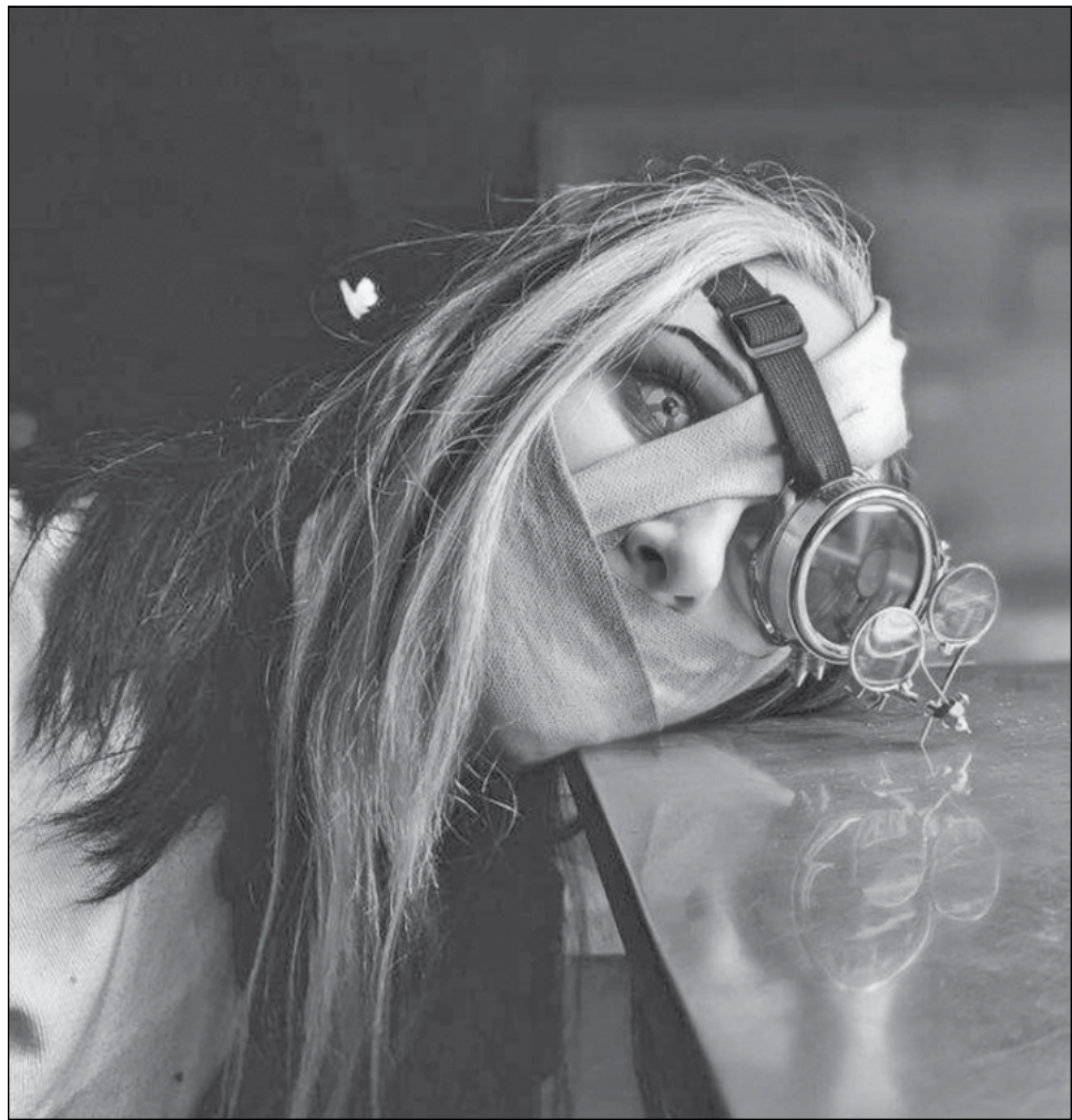
The Walk of Terror, East Troy's scariest Halloween attraction will return to the Amusement Park on weekends for the entire month of October. For details, visit thewalkofterror.com.

Good Neighbors