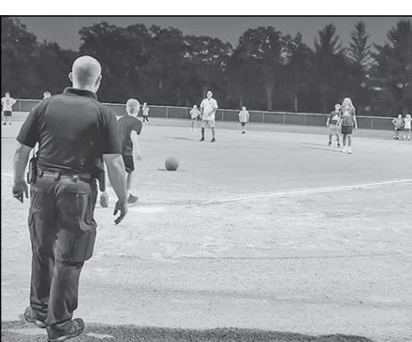
The IGET Community Center's Something To Do Kickball Game has become an annual event and is a special night of community activity for children in grades 6 through 8.

Community Straw Bale Garden: Join the Community Center's Community Garden.