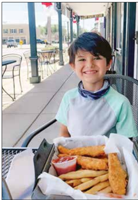
East Troy House

For more information, visit chinuksushi.com .