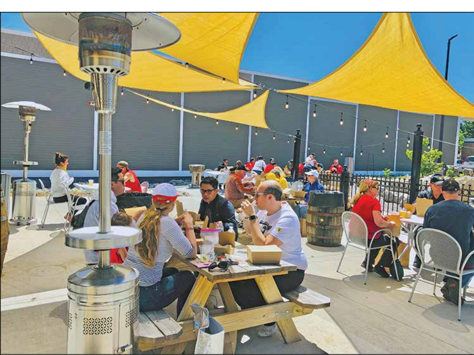
East Troy Brewery