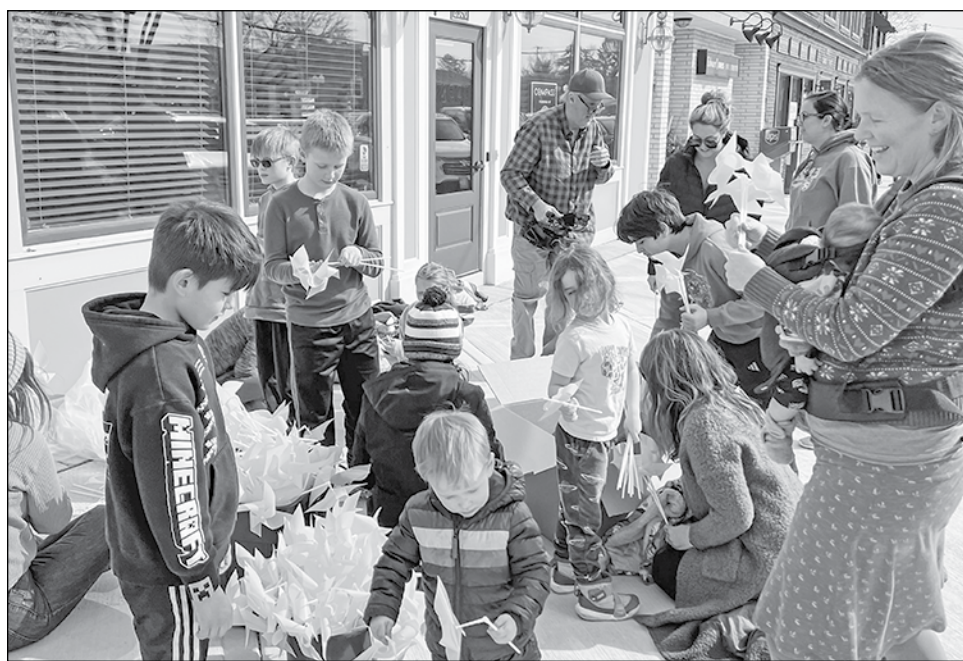
There was an amazing energy on the East Troy Village Square leading up to the April 4 election as the community joined VOTE YES for East Troy Schools volunteers to install the East Troy Pinwheel Garden, a community art project to raise awareness for the East Troy School Referendum. The garden included 1,456 Pinwheels – one Pinwheel to represent each student who would have been negatively impacted if the referendum hadn’t passed.