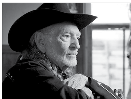
Willie Nelson's Outlaw Music Festival is stopping at East Troy's Alpine Valley Music Theatre June 24, about two months after the country music legend turns 90.

Tickets for Alpine shows can be purchased at livenation.com .