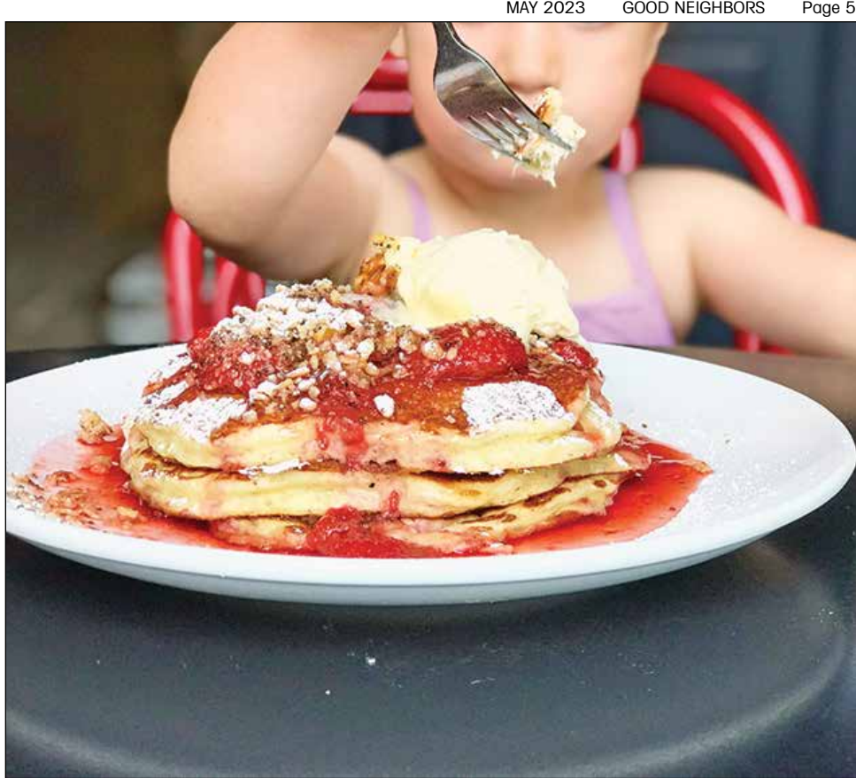
2894 on Main