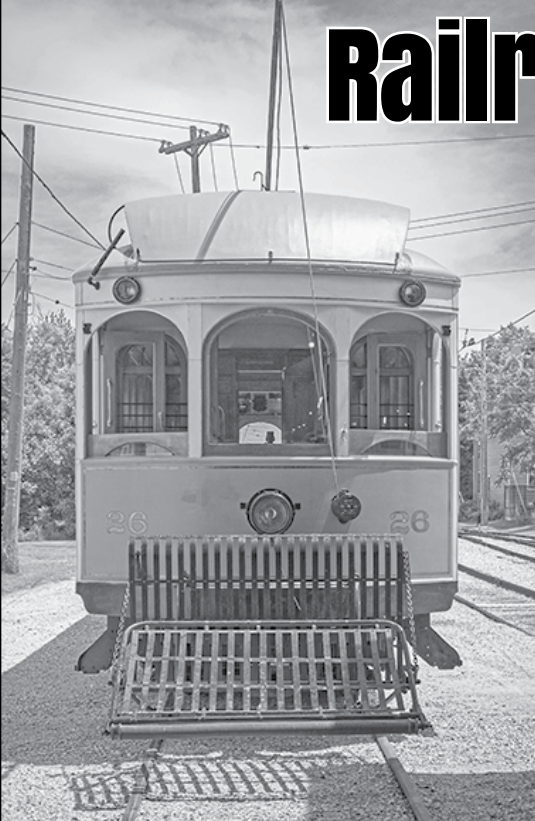
The East Troy Electric Railroad is returning this summer with rides departing from the East Troy Depot on the hour on Saturdays through early September, starting at 10 a.m. to 3 p.m. and Sundays at 10 a.m., noon and 2 p.m. Trains will begin running on Fridays, beginning June 2. PHOTO SUBMITTED Good Neighbors