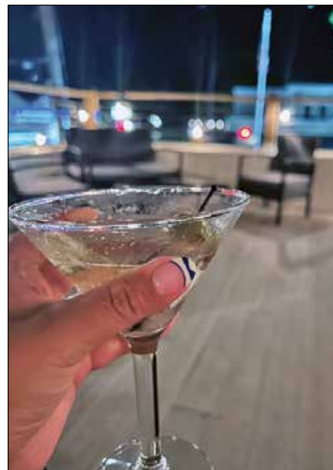
Chinuk Sushi & Grill and El Pedro Taco