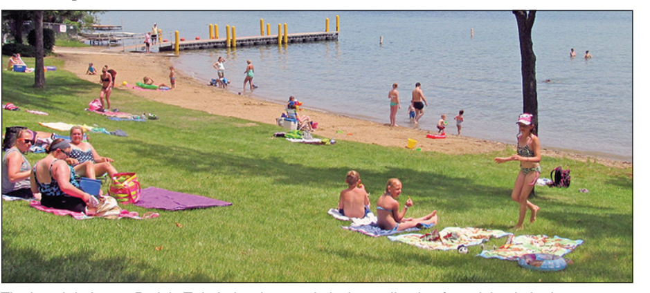
The beach in Lance Park in Twin Lakes has a relatively small strip of sand, but it the large grassy areas provide a place to sit and watch children in the water.

Daily rates are $10 for those 12 and older and $5 for ages 6-11. Changing rooms are available.